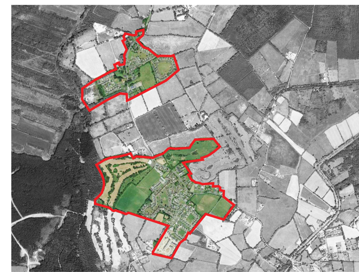
Coill Dubh and Cooleragh