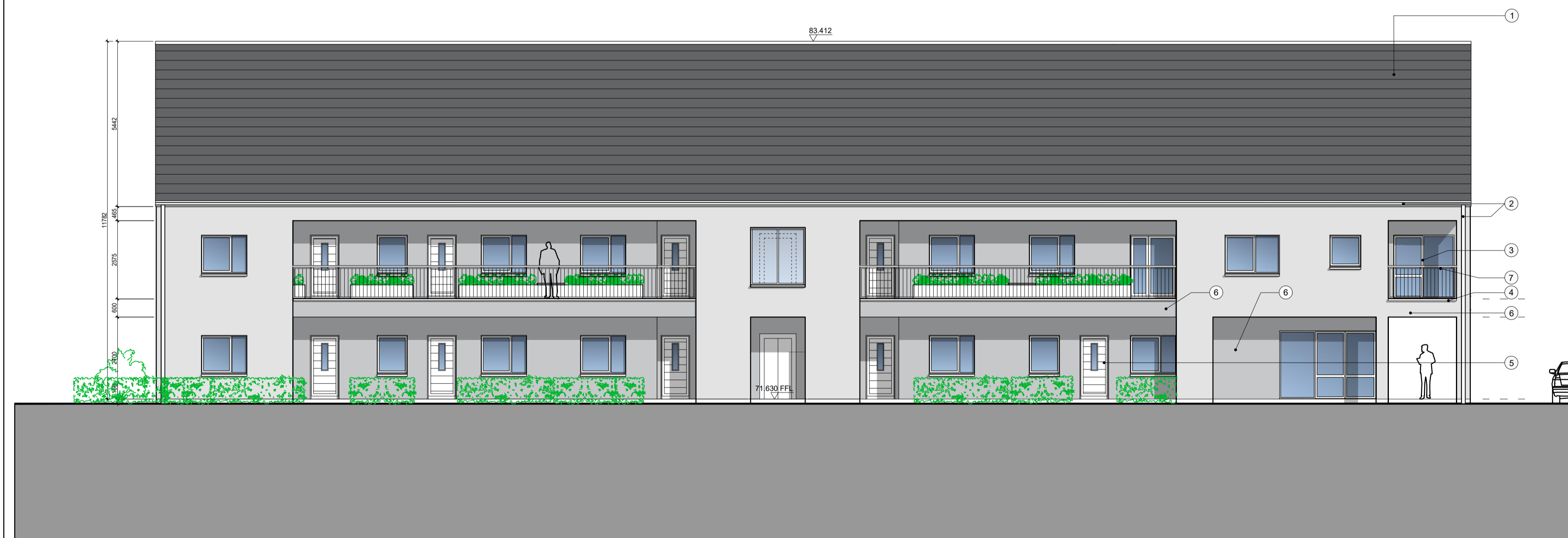
Building A - Proposed North Elevation Scale 1:100 @ A1