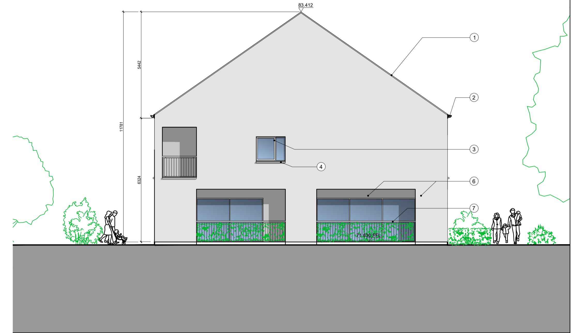
Building A - Proposed West Elevation Scale 1:100 @ A1