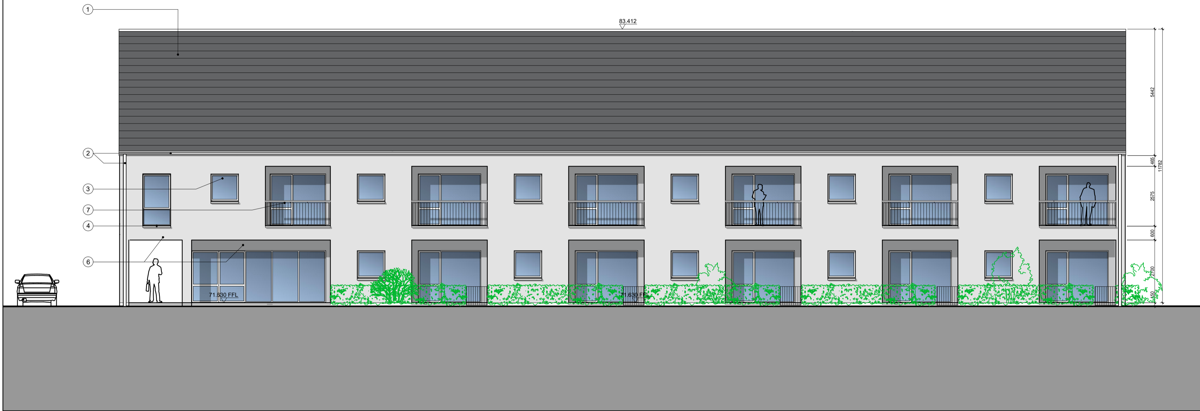
Building A - Proposed South Elevation Scale 1:100 @ A1