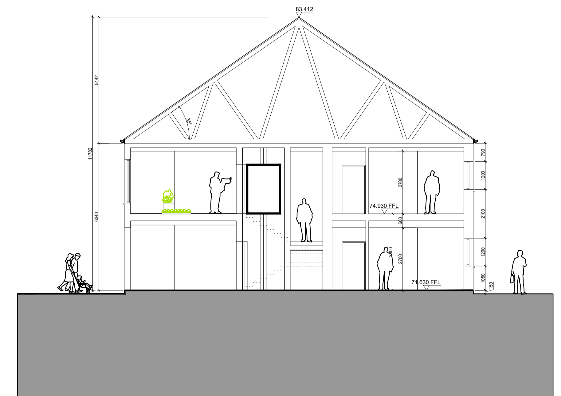
Building A - Proposed Section C-C Scale 1:100 @ A1

Proposed Units Schedule: BUILDING 'A' - 12No. Dwellings + 1 Community Room 1 No. Community Room 7 No. 1-Bed/2 Person Apartment 5 No. 2-Bed/3 Person Apartment