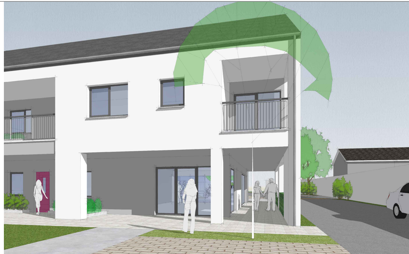
Proposed 3d View No. 5