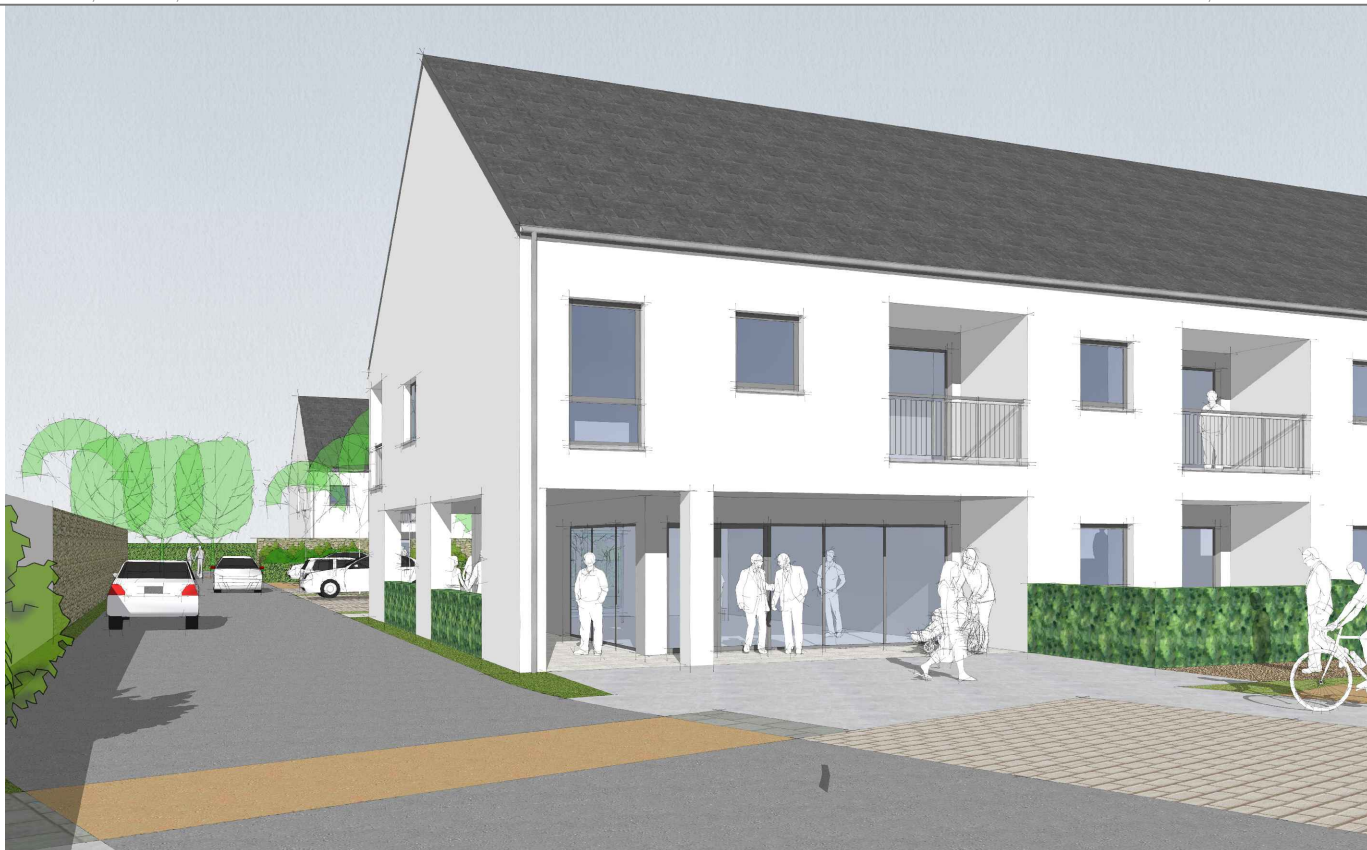
Proposed 3d View No. 4