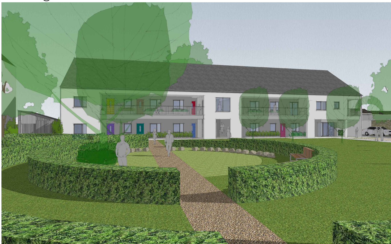
Proposed 3d View No. 6