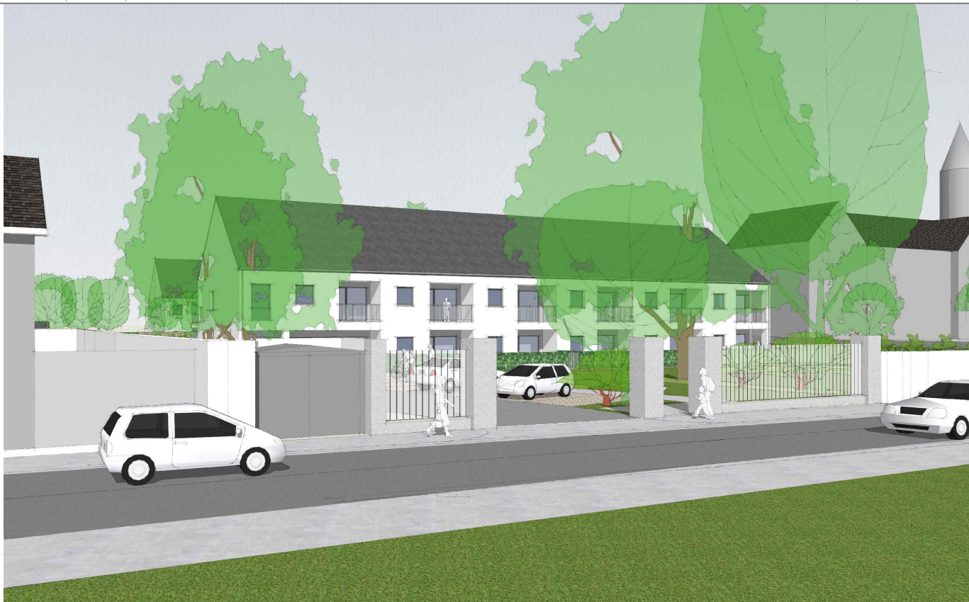
Proposed 3d View No. 1