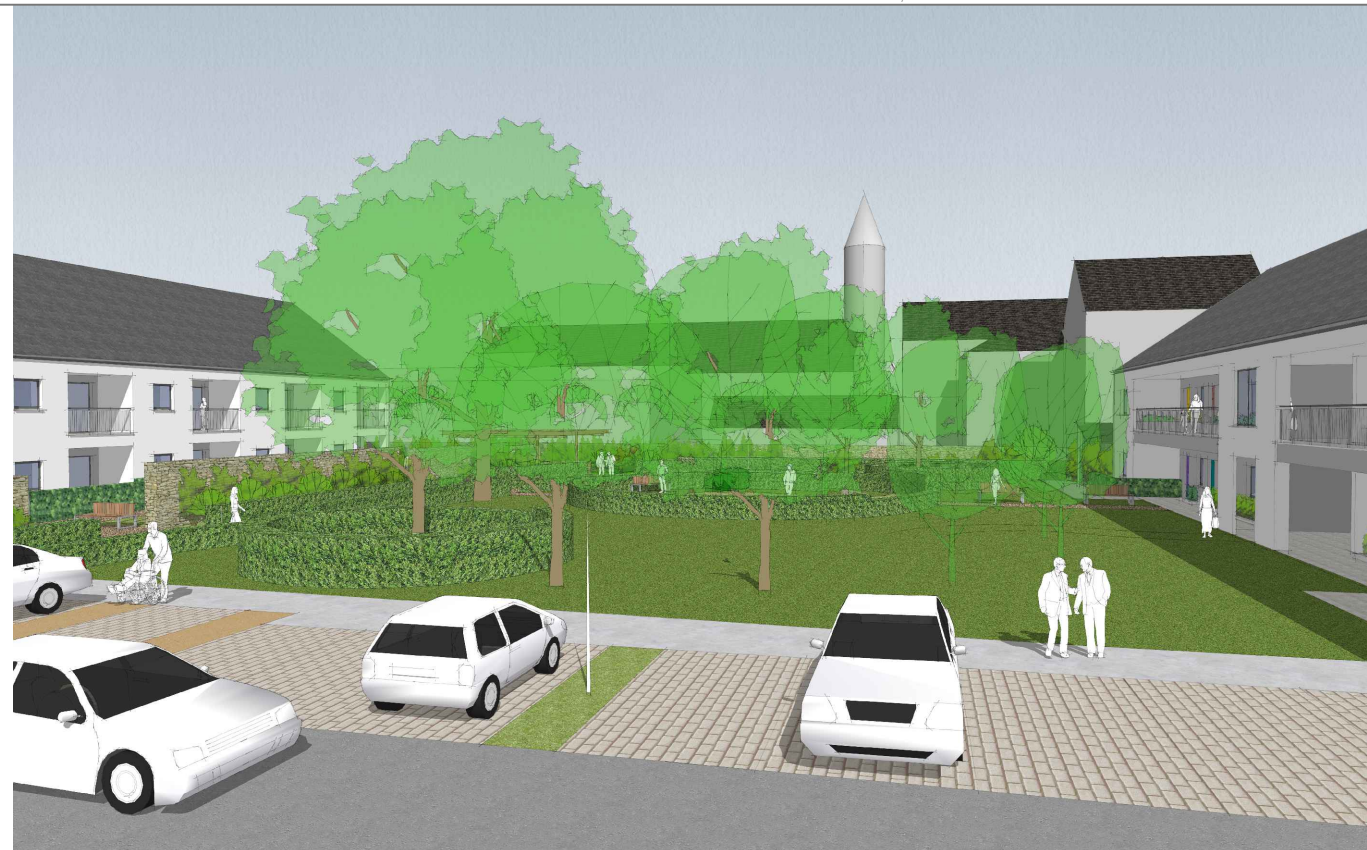
Proposed 3d View No. 2