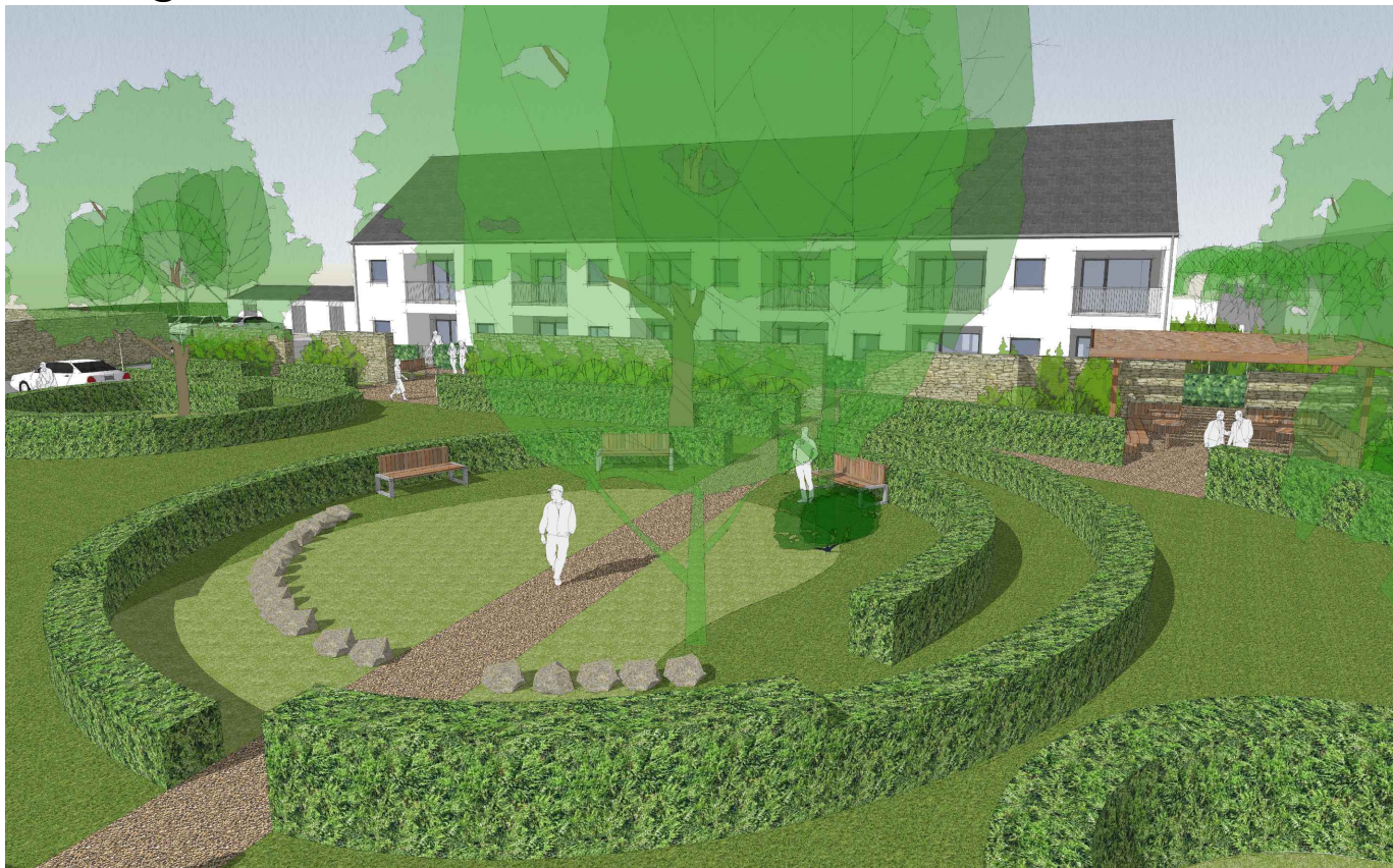
Proposed 3d View No. 3