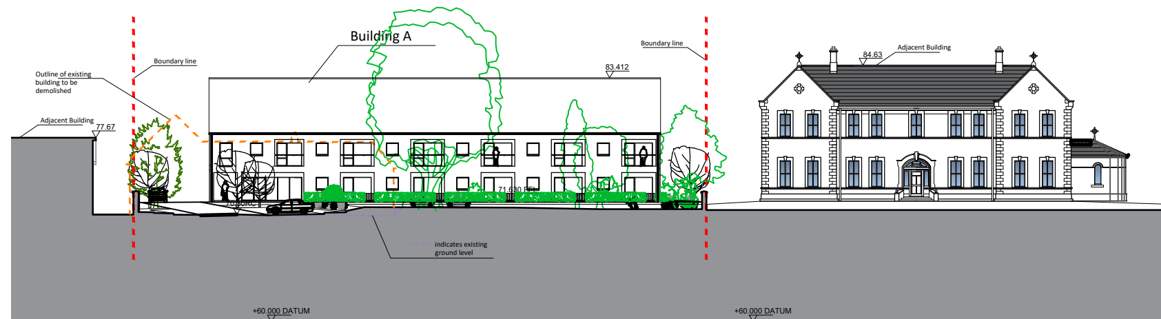
Proposed Site Section B-B Scale 1:500 @ A3