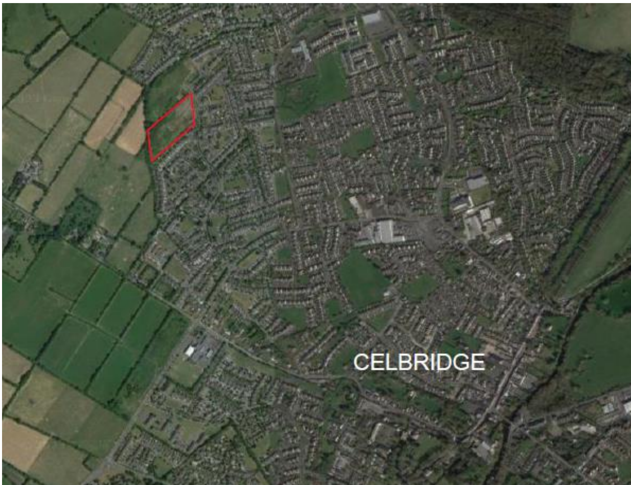
Figure 1.0 Site Context

There are no recorded archaeological monuments or protected structures within or adjoining the site. A report from John Purcell Archaeological Consultancy confirms that the site has been partially disturbed as a result of excavation works in the past. These works included deep excavation and removal of topsoil. Original fabric is only visible at the west of the site and no significant impact on the archaeological landscape is predicted.