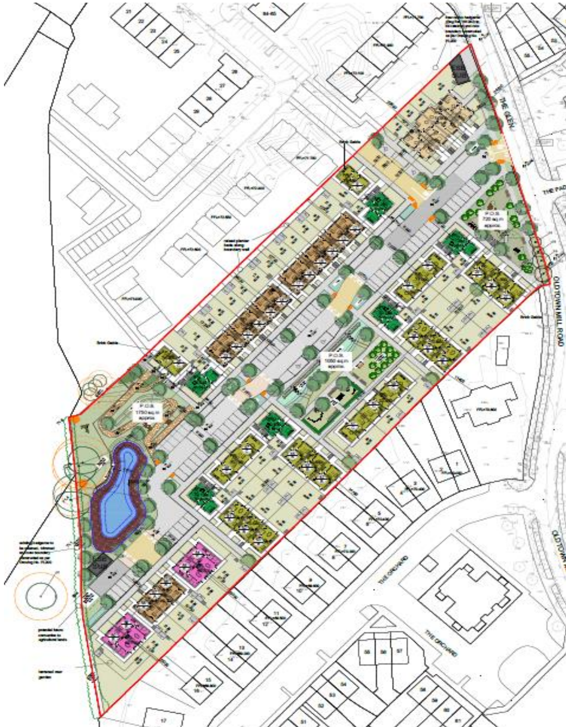
Figure 3.0 Proposed Site Layout

A high level of passive surveillance to the network of streets and spaces is provided. Cumulatively, a total of 0.355 hectares of public open space is provided within the development proposal, equating to 20.7% of the overall site area.