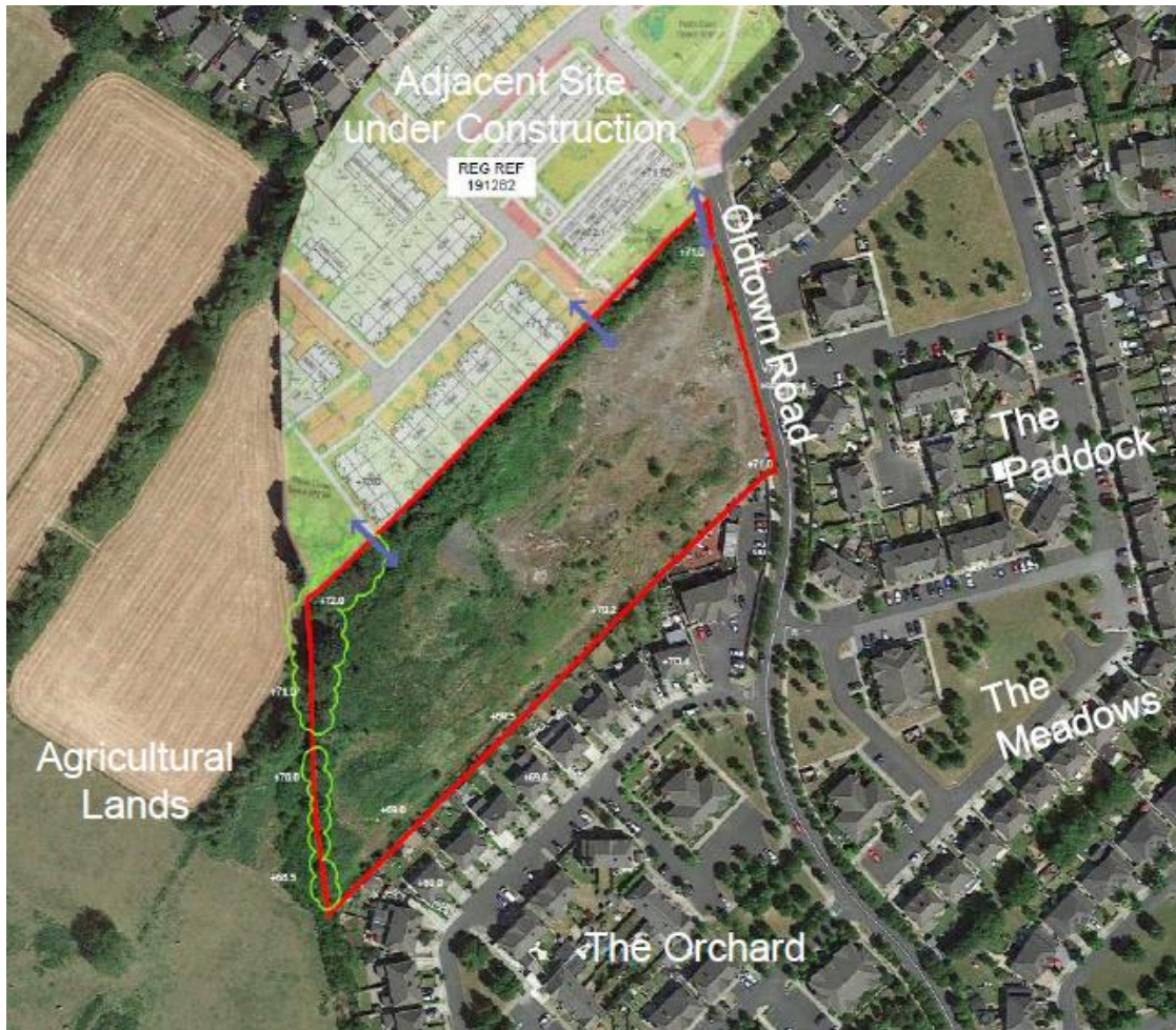
Figure 2.0 Layout of Permitted Housing Development to the north.

Subsequently, planning permission was sought and granted for 75 no. residential units on the adjoining land to the north, under planning file reference P19/1282. The layout and configuration of the adjoining development to the north has influenced the design approach on the subject site, as detailed in Figure 2.0. Further condition 3(b) of the grant of permission requires that the hedgerow along the south boundary of the site shall be removed by the developer. A timescale shall be agreed in writing with the planning authority.