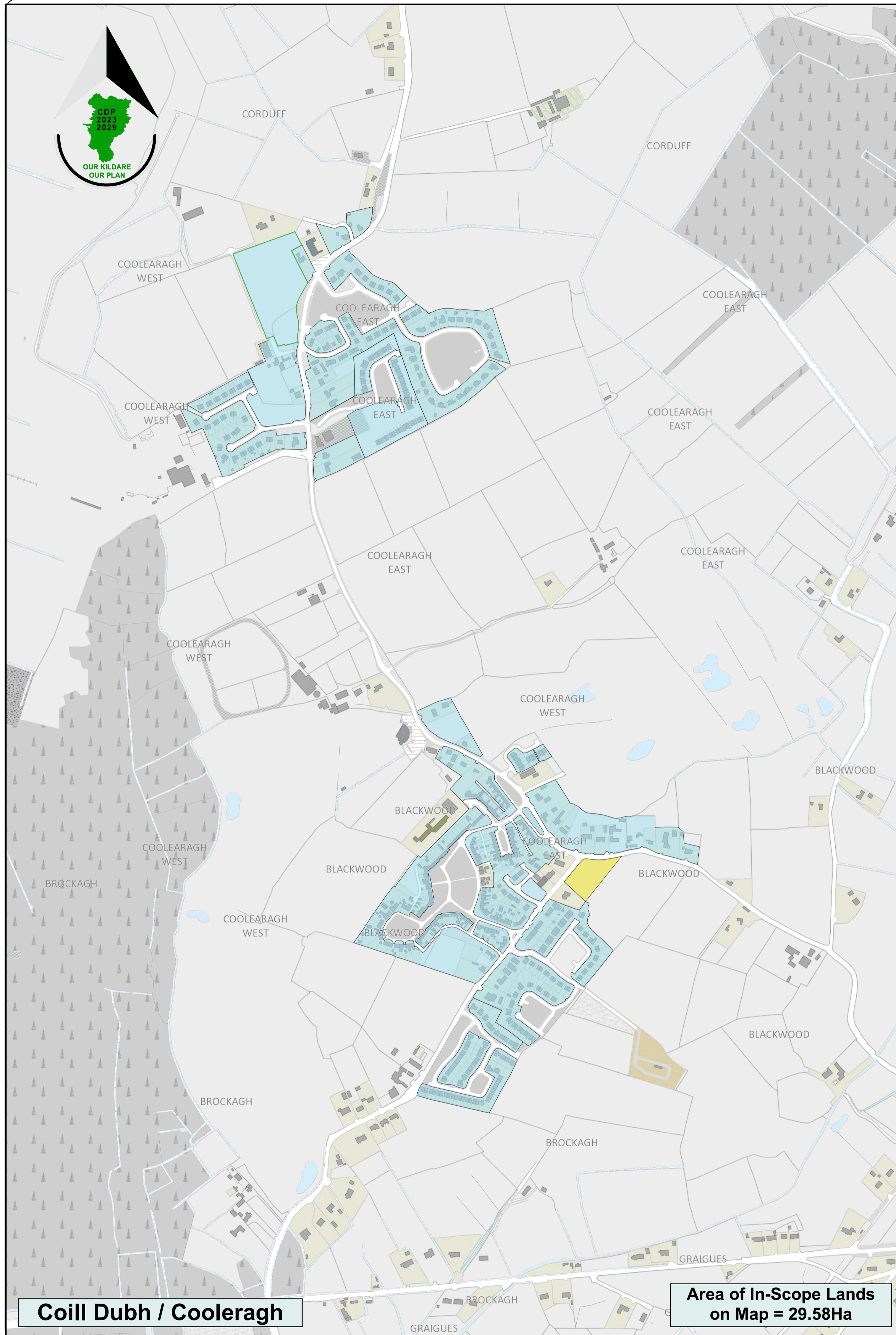
Coill Dubh / Cooleragh