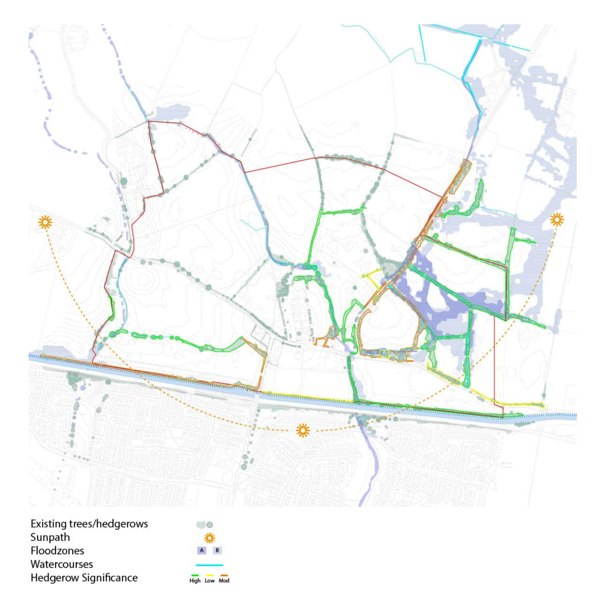
Figure 3 Natural Features within the Confey Masterplan (Source: KCC 2023)

As noted in the SEA Addendum, potential negative effects were noted for Biodiversity, Water, Air and Noise, Land and Soil and Landscape and Visual. However, the SEA Addendum of Material Alterations stated: