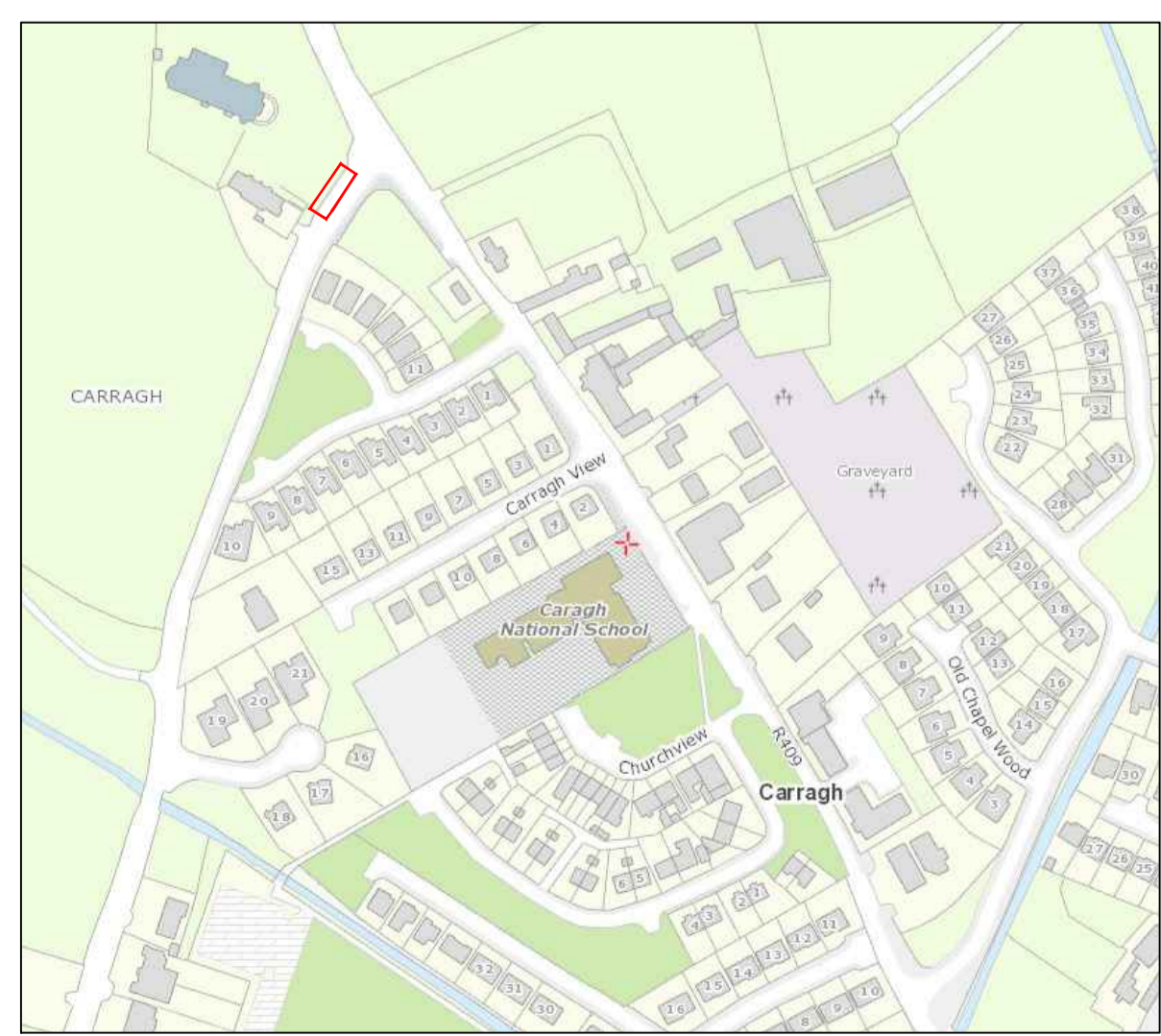
Figure 3 - OSI Identification map