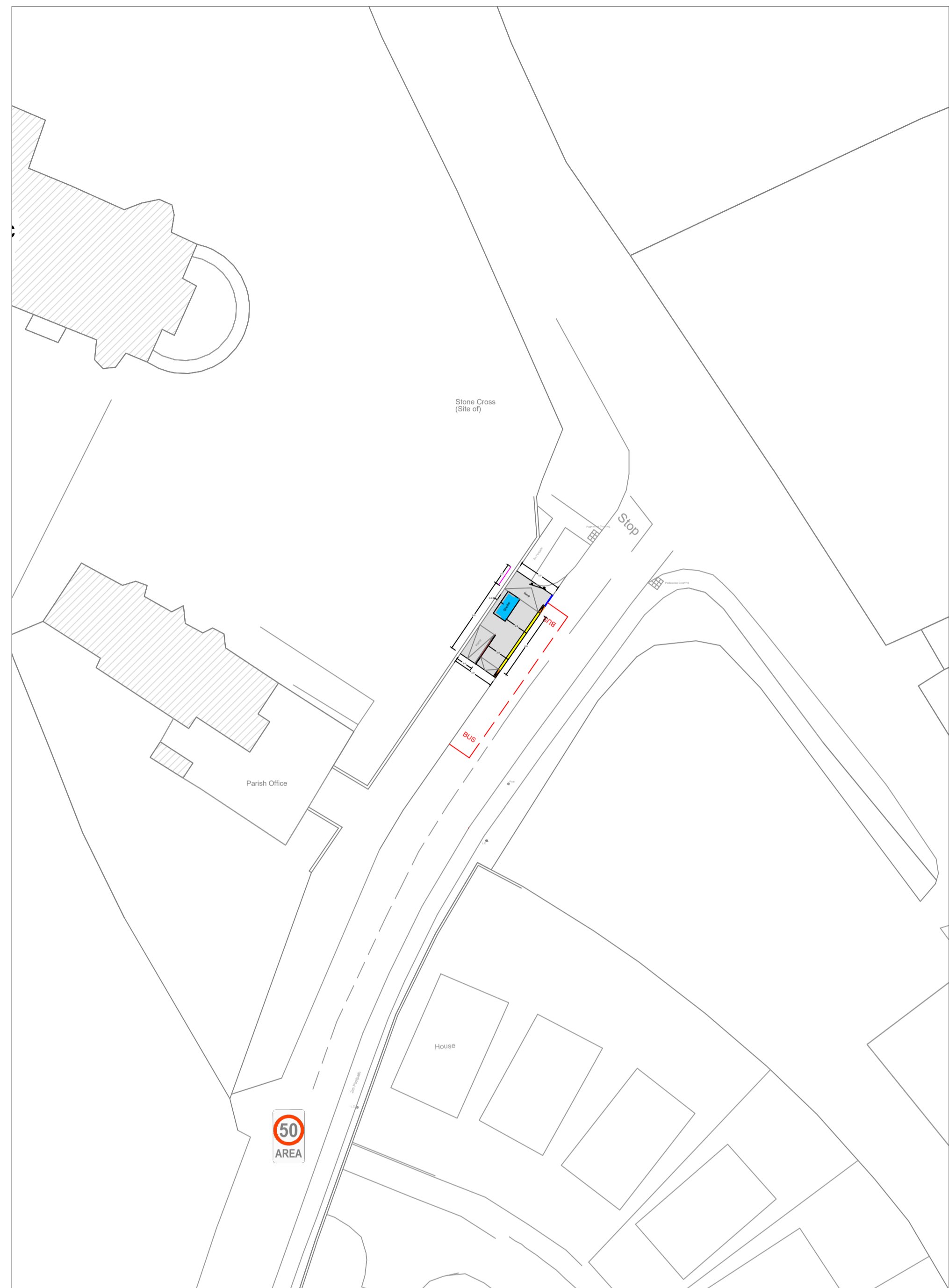
Figure 1 - Layout Plan(1) Proposed new Bus Shelter/Boarding platform