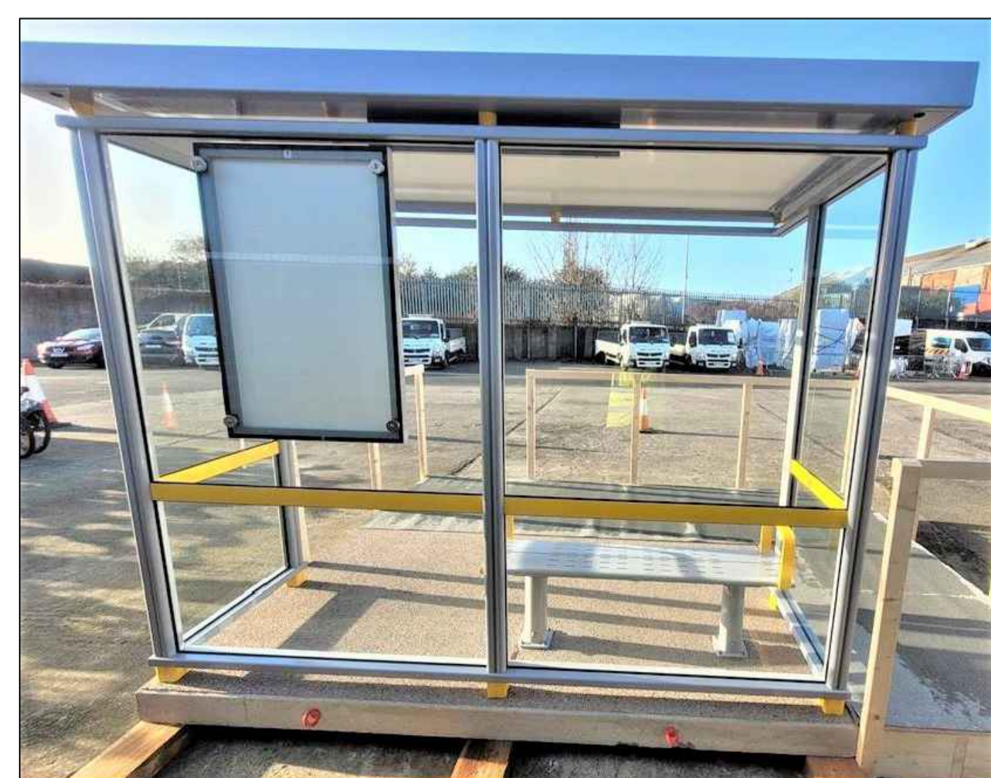
Figure 2 - Bus shelter example "JCDecaux, 2 bay City 90 Pre-Assembled Shelter"