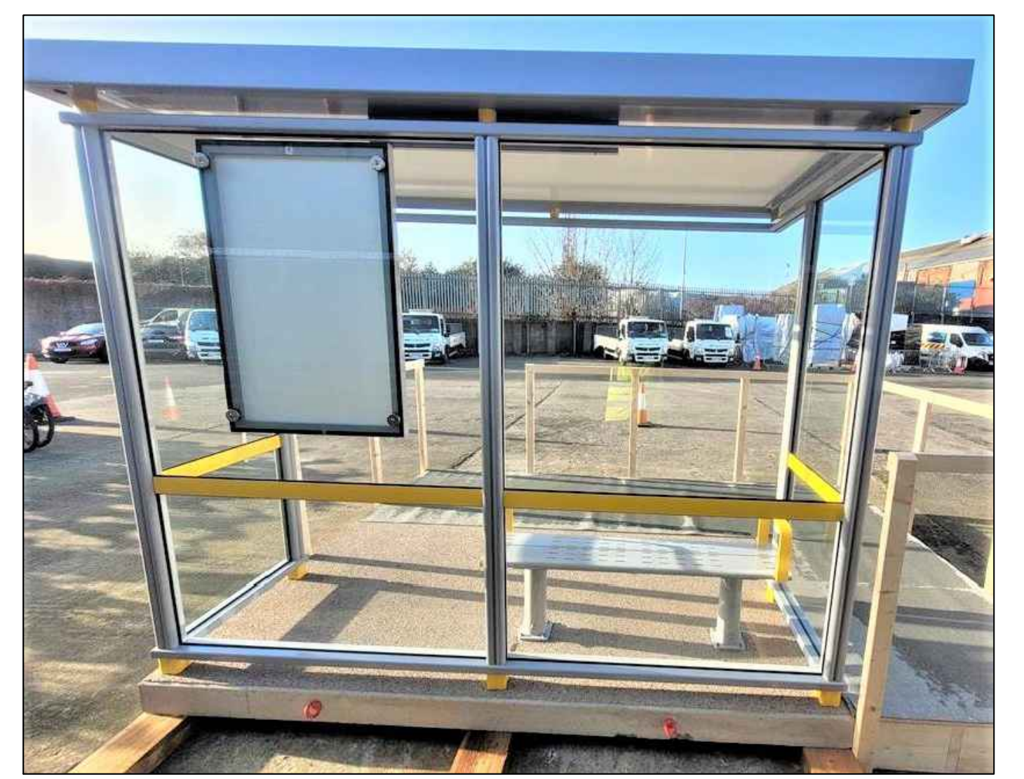
Figure 2 - Bus shelter example