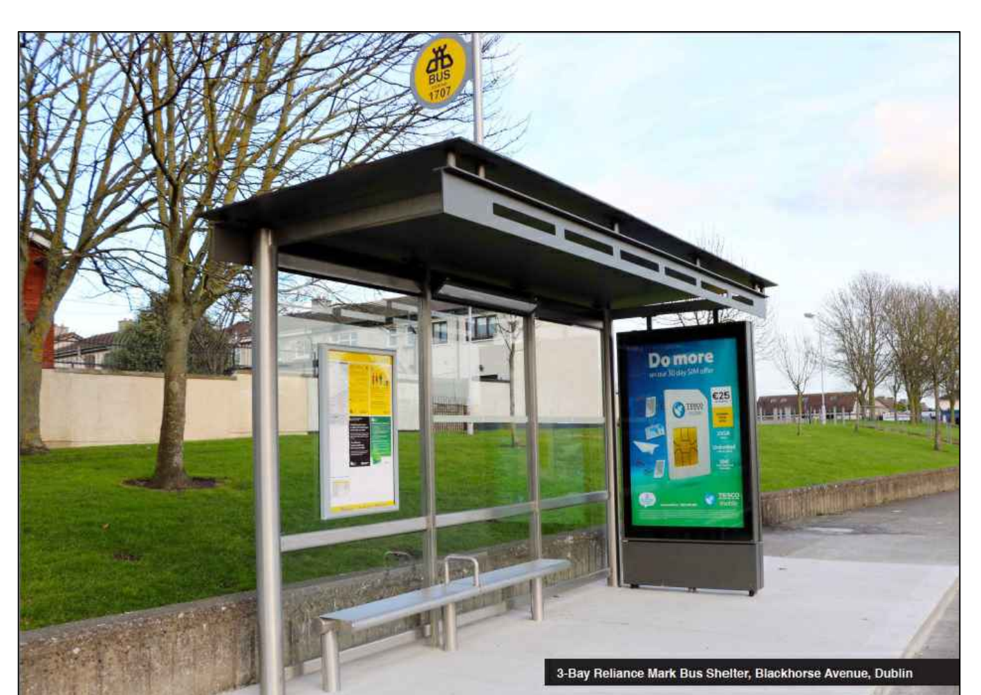
Figure 2 - Bus shelter example