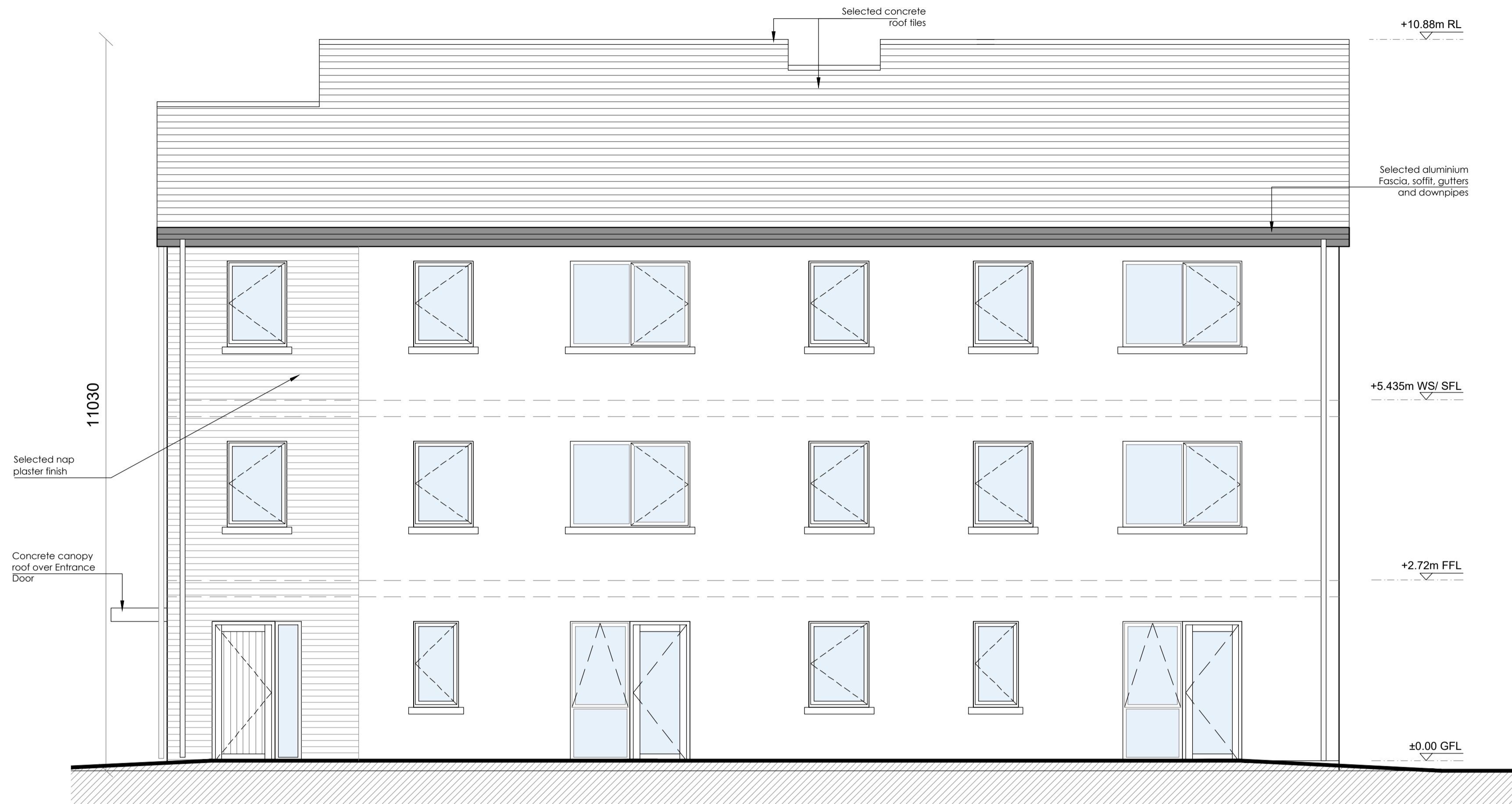
REAR ELEVATION (Scale 1:50)