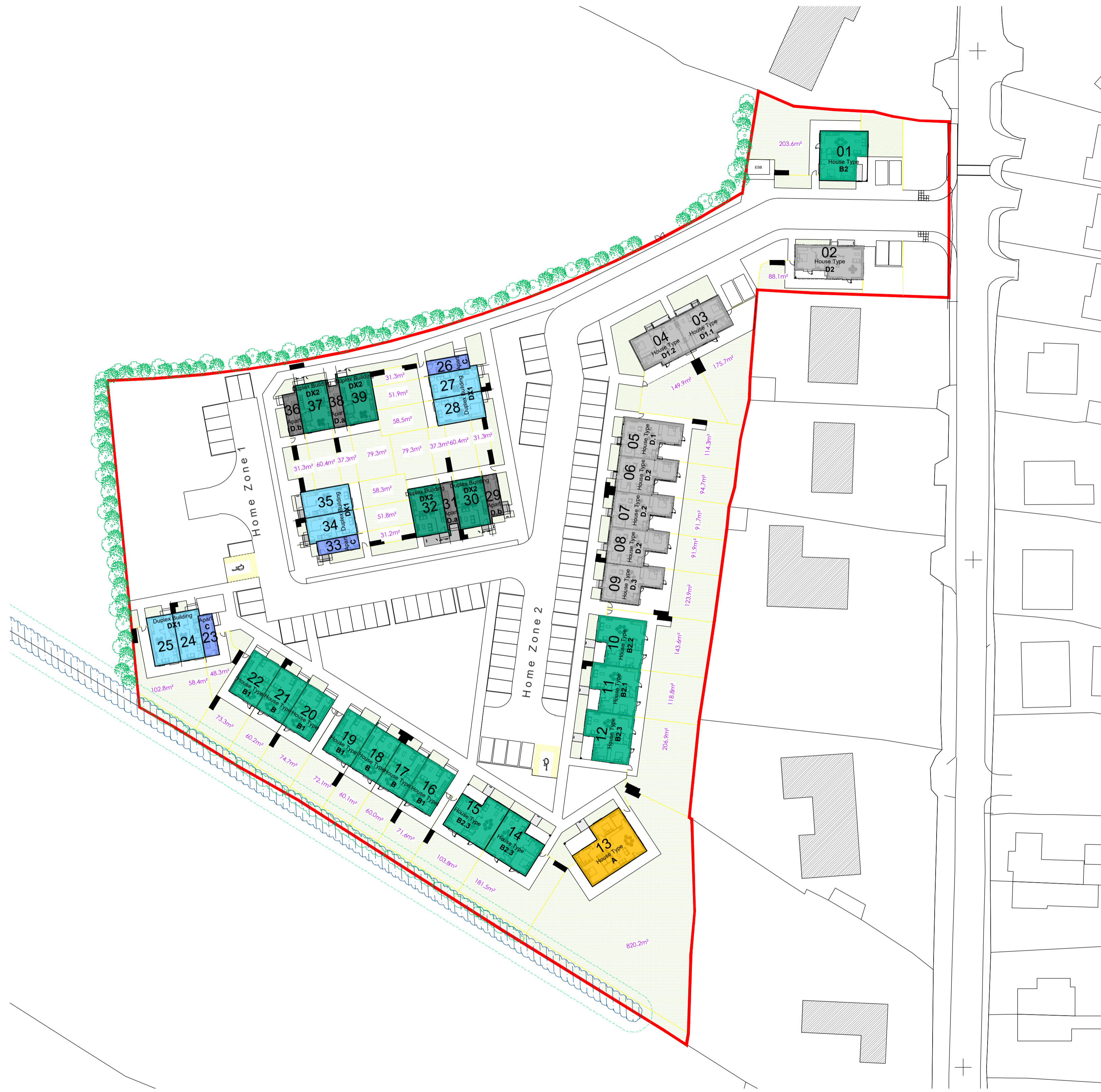
PROPOSED SITE LAYOUT (Scale 1:500)