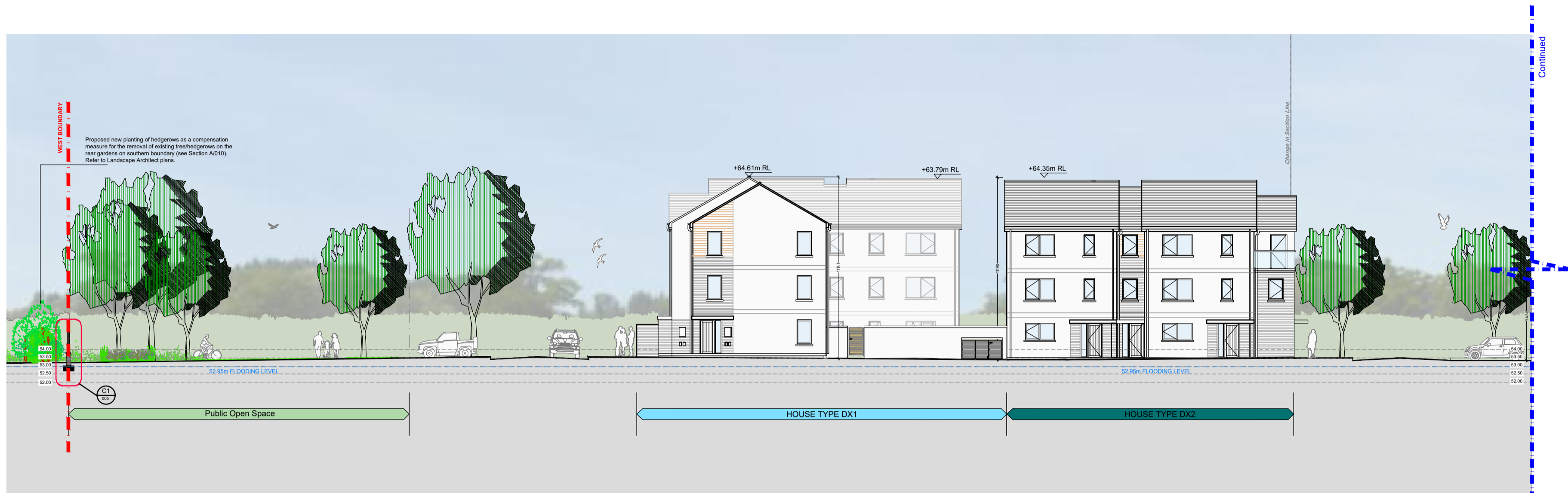
CONTEXT ELEVATION - SECTION C-C (Scale 1:200)