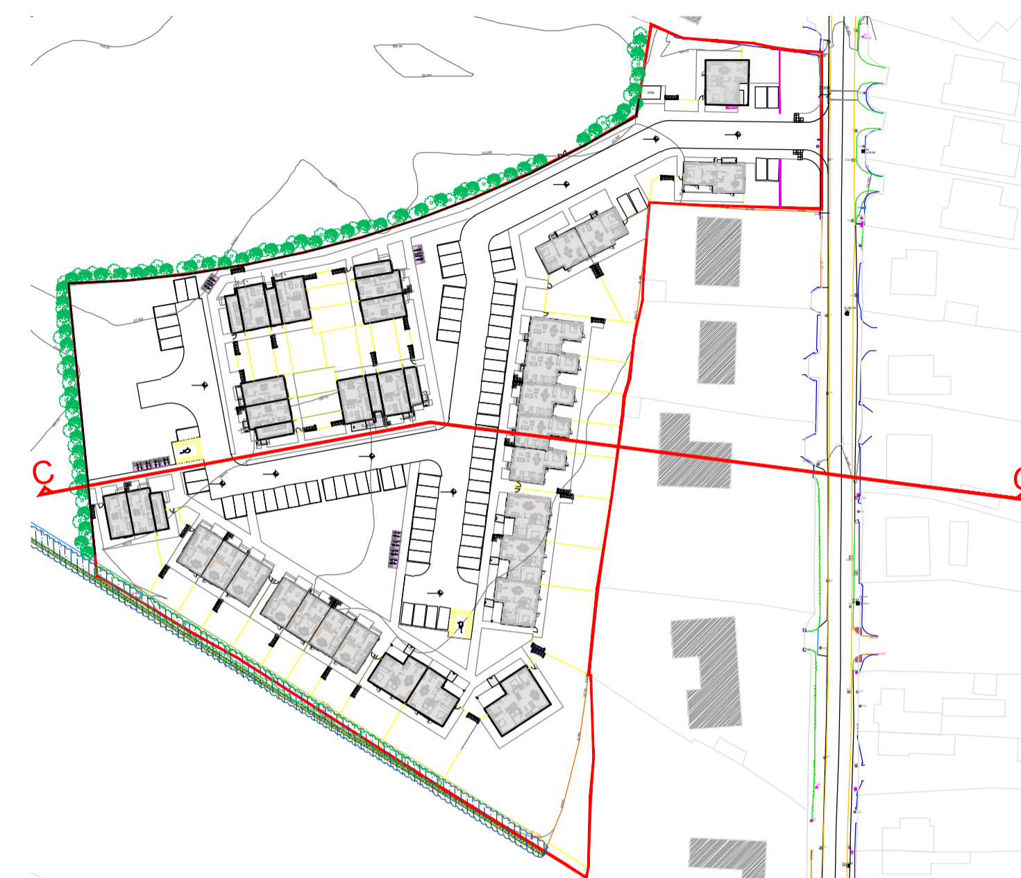
KEY PLAN (Not to scale)