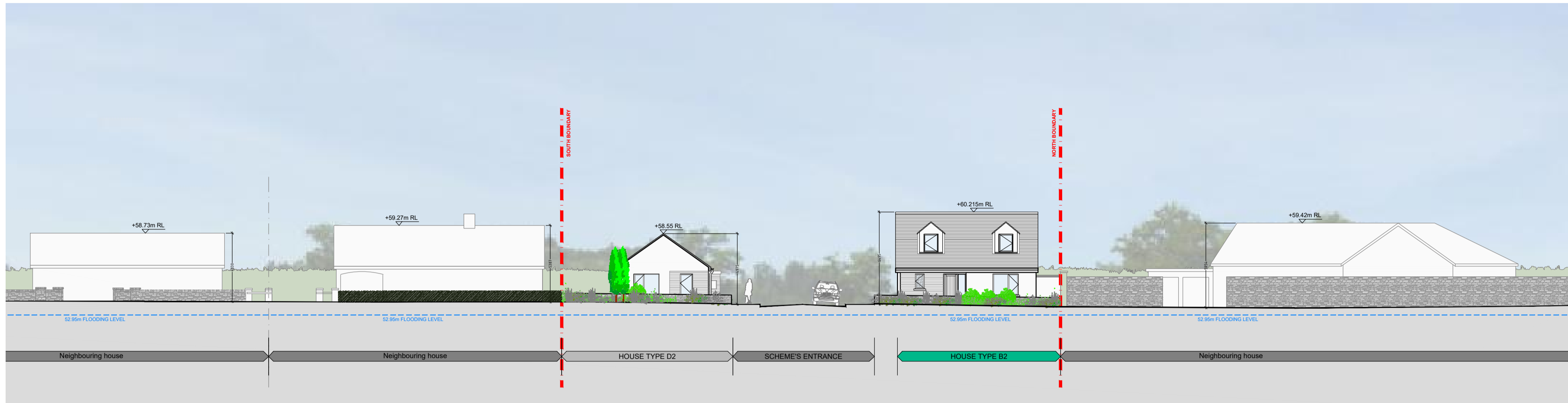
CONTEXT ELEVATION - SECTION A-A (Scale 1:200)