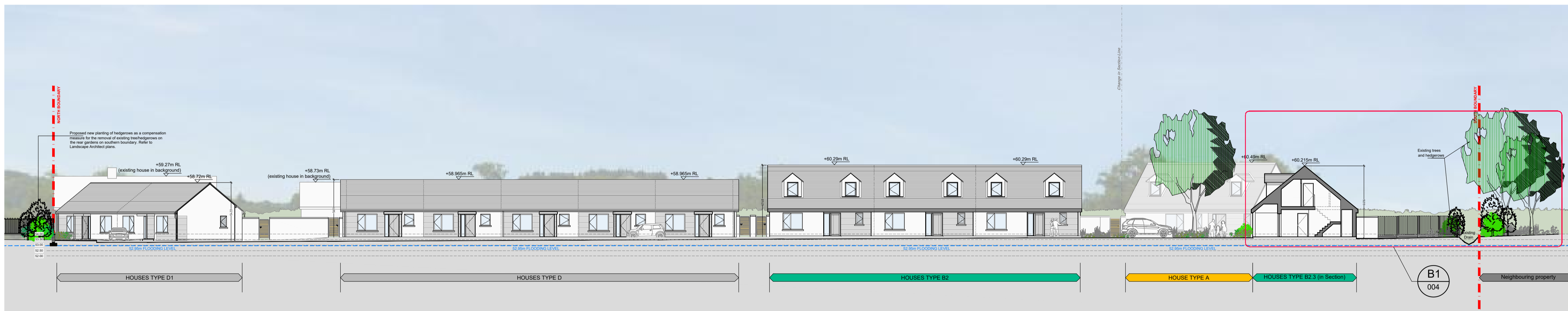
CONTEXT ELEVATION - SECTION B-B (Scale 1:200)