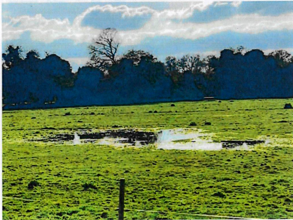
Recent images of surface flooding on the subject site