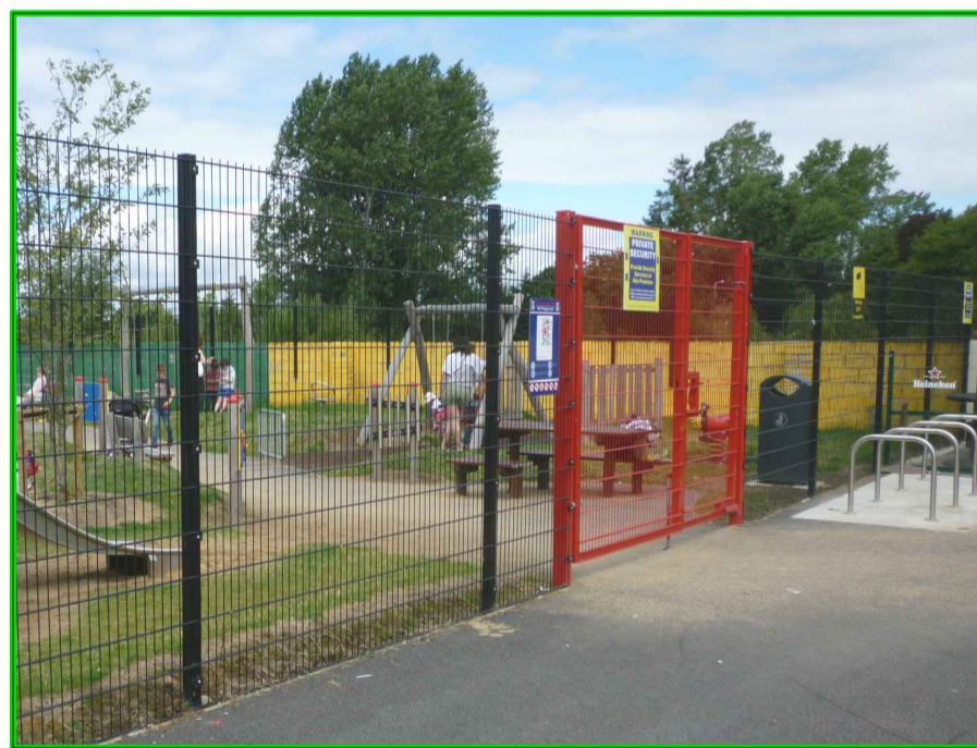
Proposed fence and entrance gates for Playground west Boundary