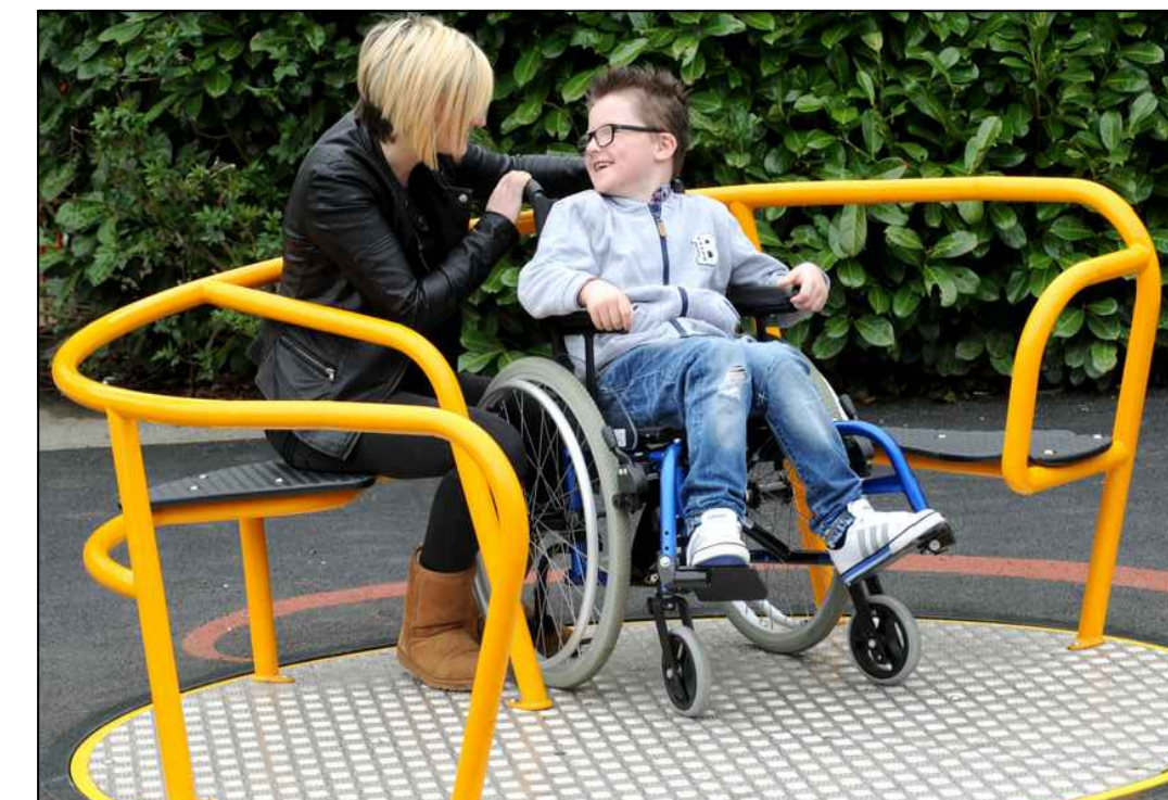
wheelchair assessable roundabout