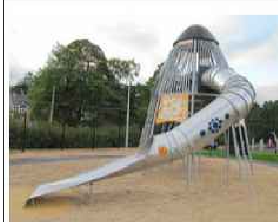
Senior Multi Unit with tube slide