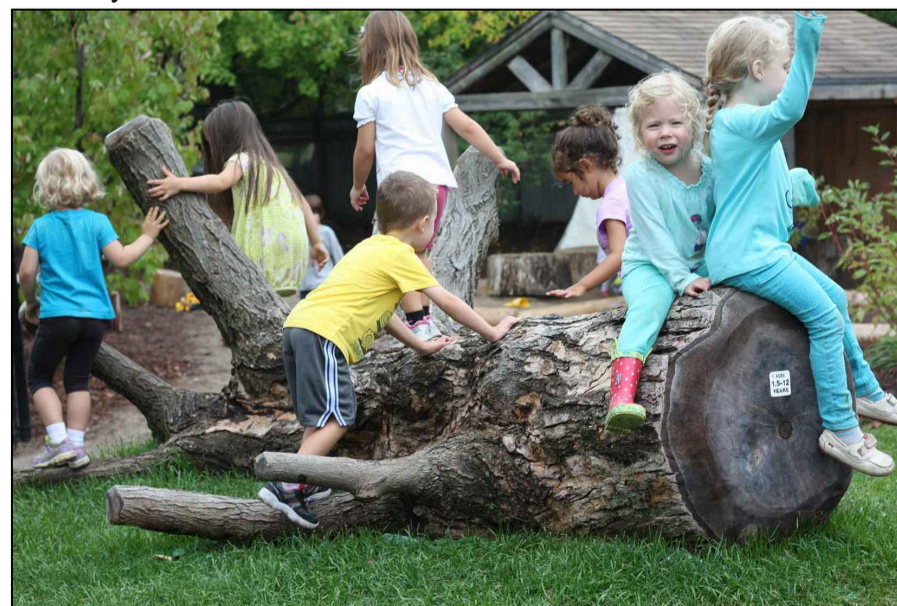
Natural Landscaped Play Features for unscripted play opportunities