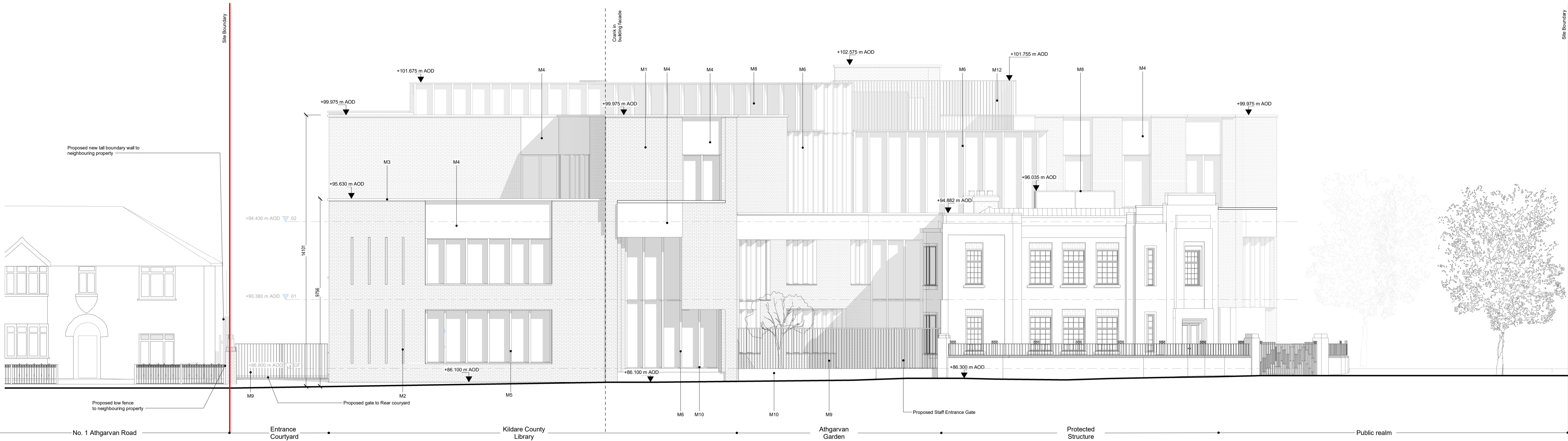
1. Elevation A 1:100