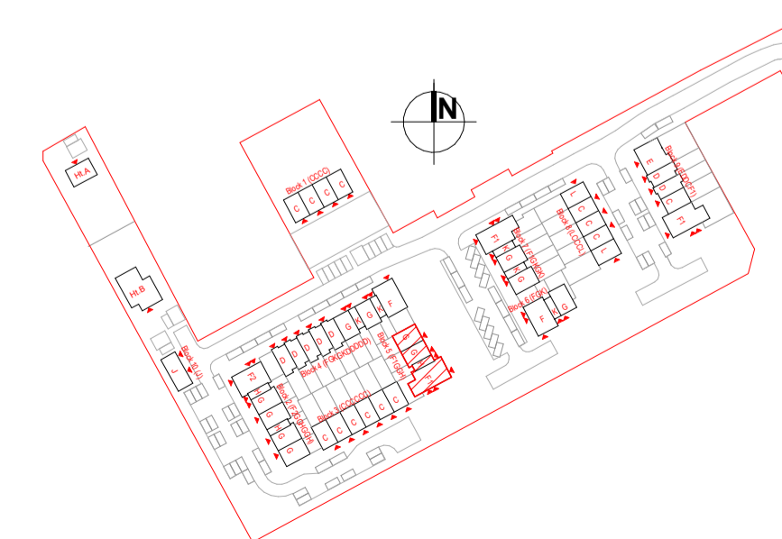
Key Plan 1 : 2500