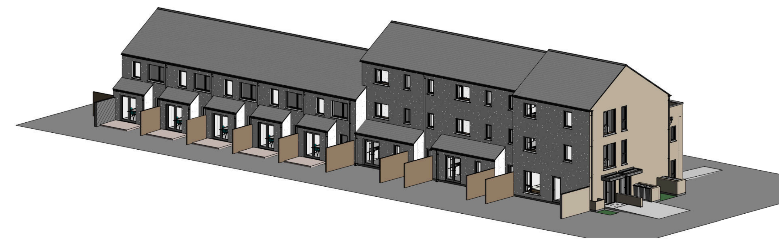
4 3D View Right