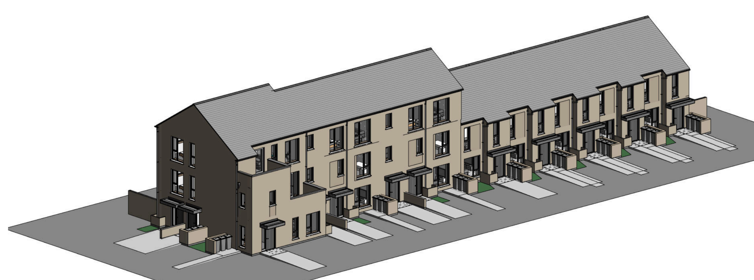
3 3D View Left

All works to be carried out using proper materials which are fit for the use they are intended and for the condition in which they are to be used. All materials used in connection with the works to comply with the construction products regulation (EU) no. 305/2011 and the harmonised technical specifications/standards that fall within the remit of the CPR no. 305/2011. Figured dimensions must be used in preference to scaled dimensions. Any dimensional discrepancies must be reported to the Architect immediately. This drawing remains the copyright of van Dijk Architects. It must not be used for any purpose building or otherwise without the express permission of the practice. Do not copy or redistribute these drawings or any additional information without the expressed approval of van Dijk Architects.