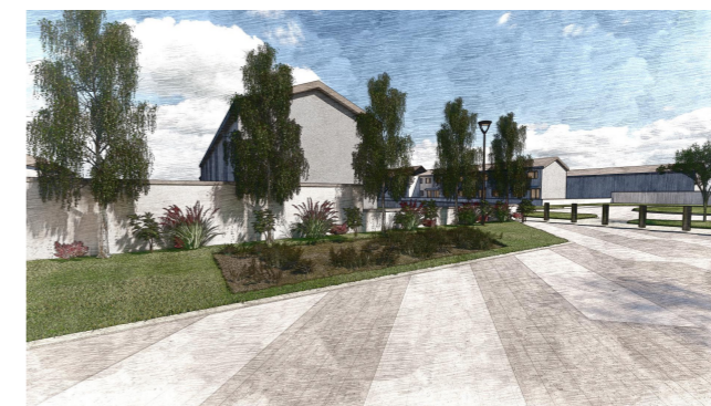
SURFACE WATER RETENTION AREA & PLANTING