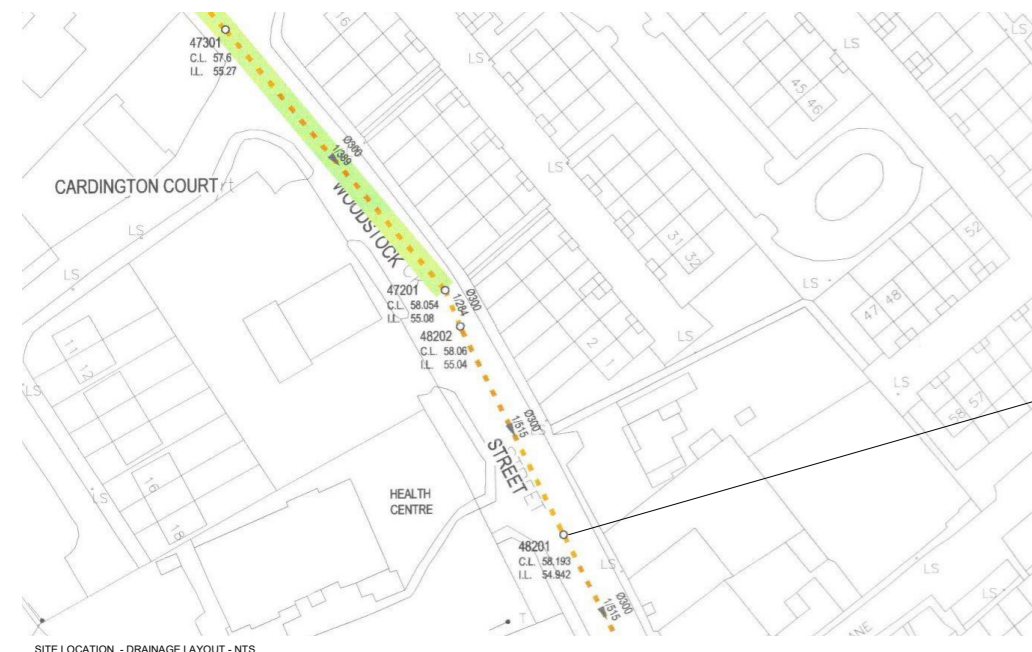
SITE LOCATION - DRAINAGE LAYOUT - NTS

Drawn By: Author Checked By: Checker Date: 14/10/2022 10:47:23