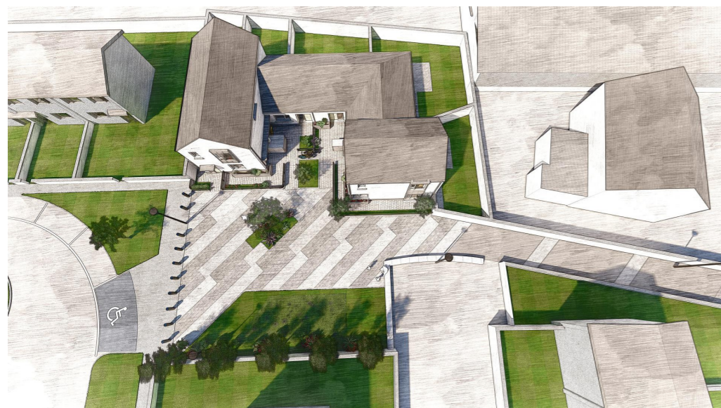
Birdseye View Roof Plan 01