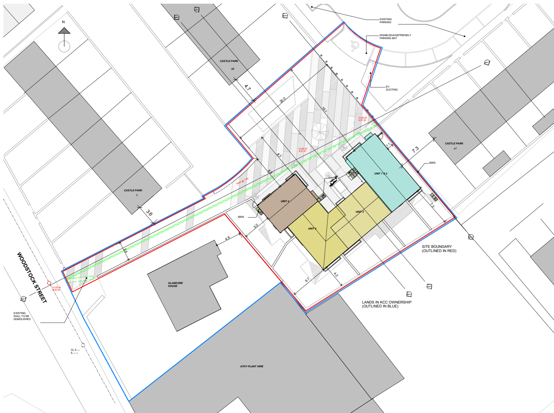
1 SITE LAYOUT PLAN P8-08 1:200

Drawn By: Author Checked By: Checker Date: 14/10/2022 10:46:30