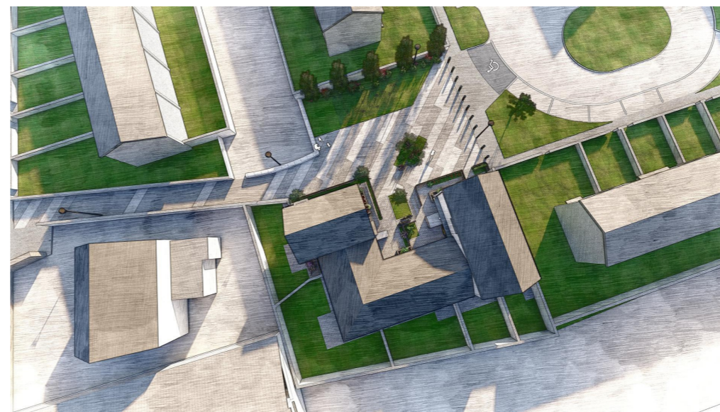
Birdseye View Roof Plan 02