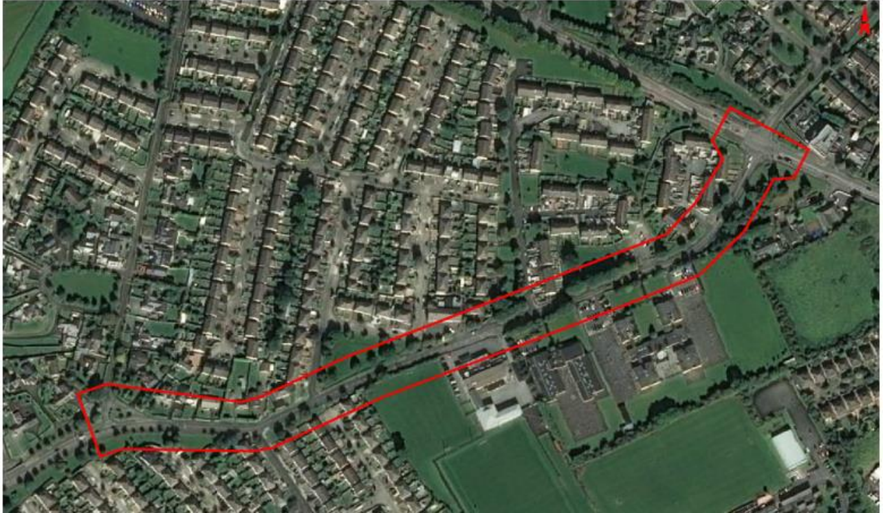
Figure 2 - Project Area

The project area measures approximately 700m from Accommodation Road to Station Road on Green Lane.