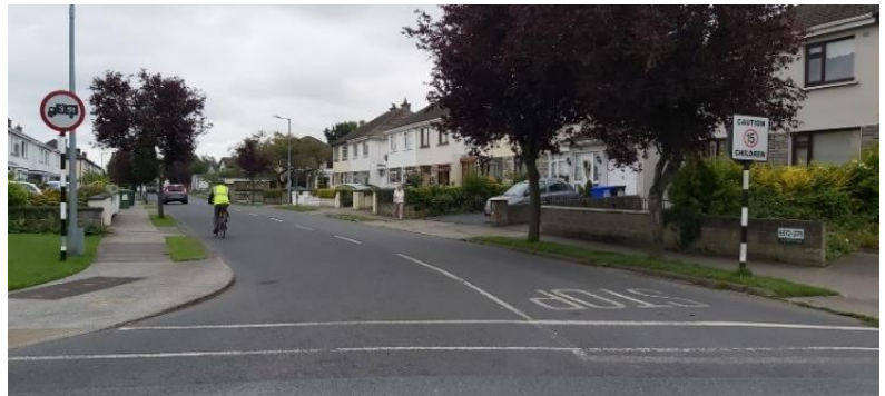
Figure 6 – Castletown Junction

There are five side roads and fifteen vehicular accesses (driveways, car parks etc.) on Green Lane. The majority of these side road junctions have large corner radii and dropped kerbs with tactile paving for pedestrian crossings. Castletown can experience relatively high numbers of journeys as it provides access to Celbridge Road.