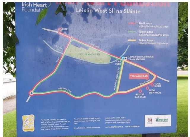
Figure 9 - Signed Walking Route

The current footway is either directly adjacent to the carriageway or set back with a green verge buffer. The current footway provision is mixed with some poor-quality surface in sections and discontinuity in others. As stated above, the footway outside the schools was upgraded recently. Some areas of concern were highlighted through engagement including the step to the east of Paddy Power and the location of some street furniture in the middle of the footway. Green Lane is also part of the Leixlip West Slí na Sláinte Route.