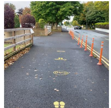
Figure 3 – Footway outside the schools

There is also Leixlip Louisa Bridge rail station approximately 500m outside the project area at the north end of Accommodation Road.