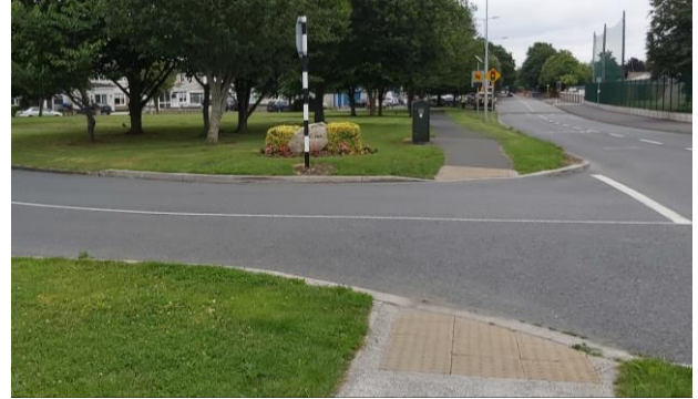
Figure 5 - Pedestrian Crossings