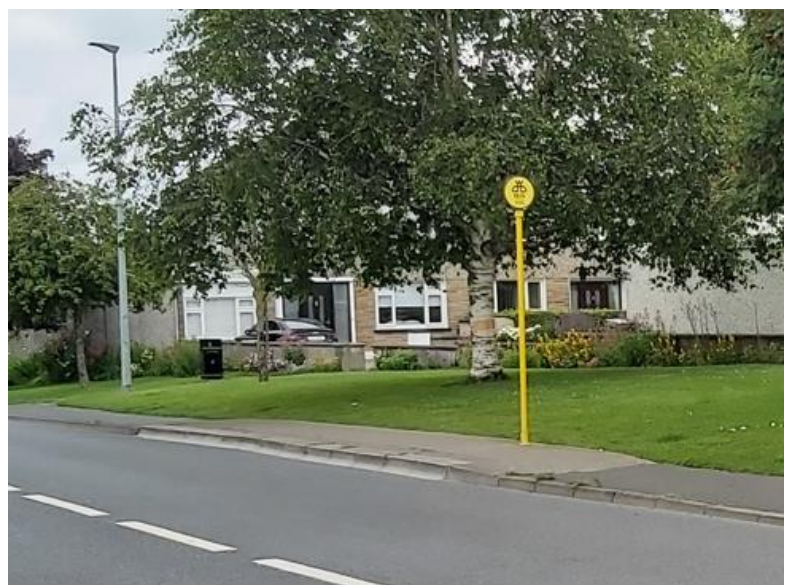
Figure 7 - Bus Stop

There are four bus stops with high access kerbs on Green Lane. There are no bus shelters or bus laybys and the buses currently stop in the carriageway. Some of the existing bus stops have the bus cage markings on the road. There are four bus services that currently use Green Lane; 52, C5, L59, X25.