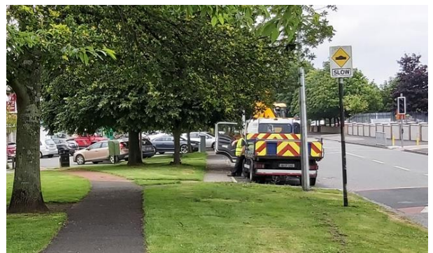
Figure 8 - Existing Parking