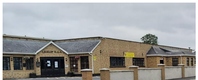
Figure 4 - Leixlip GAA