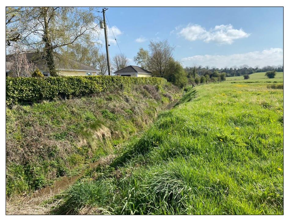
Plate 2 The stream at the site is clearly maintained and has high banks.