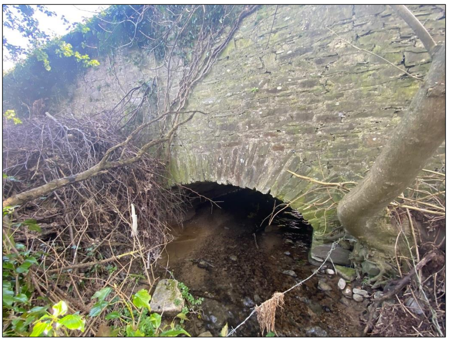
Plate 4 Moone Village bridge is very low with minimal space underneath.