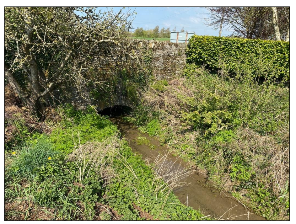
Plate 1 Moone Village Bridge.