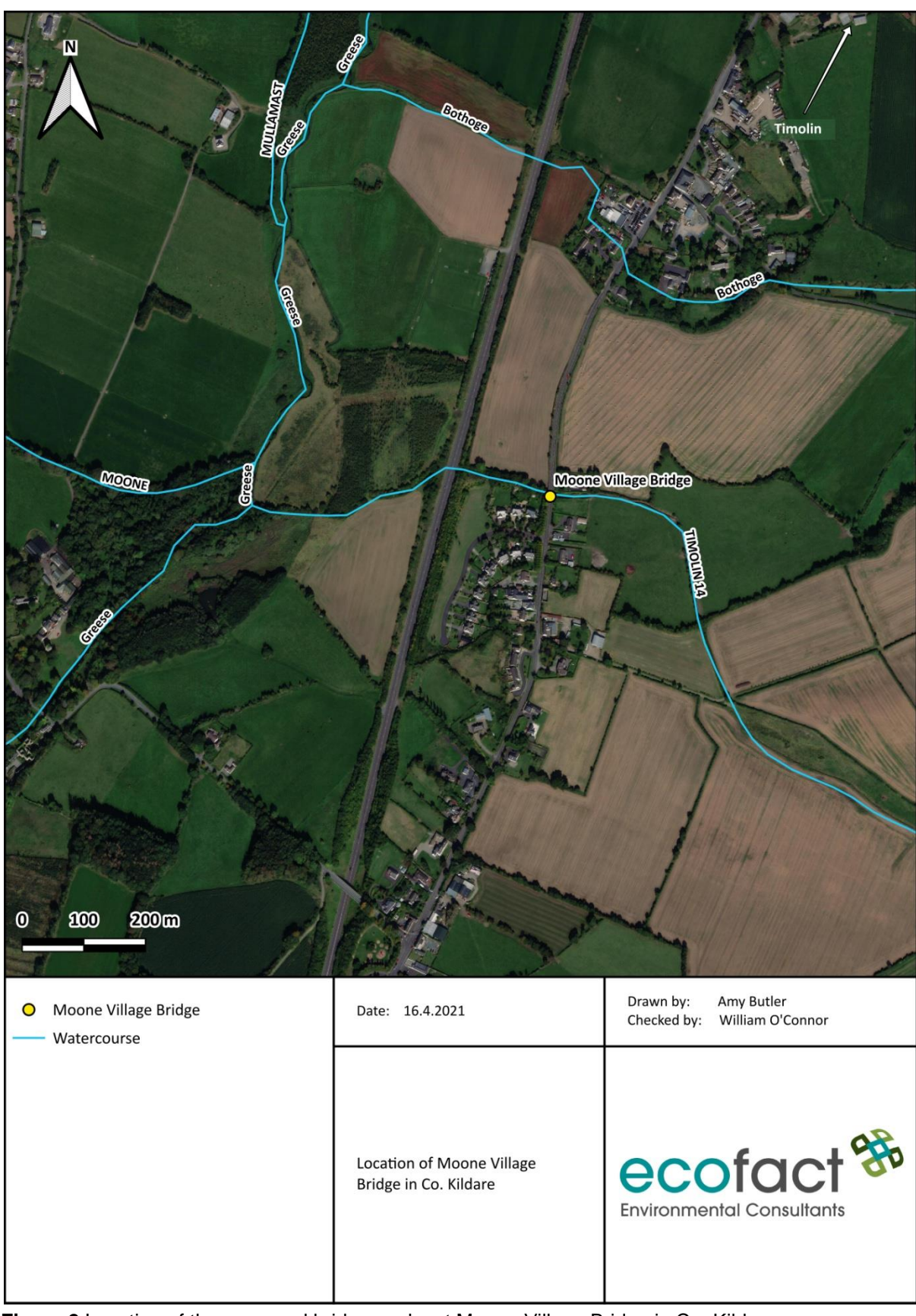
Figure 2 Location of the proposed bridge works at Moone Village Bridge in Co. Kildare.