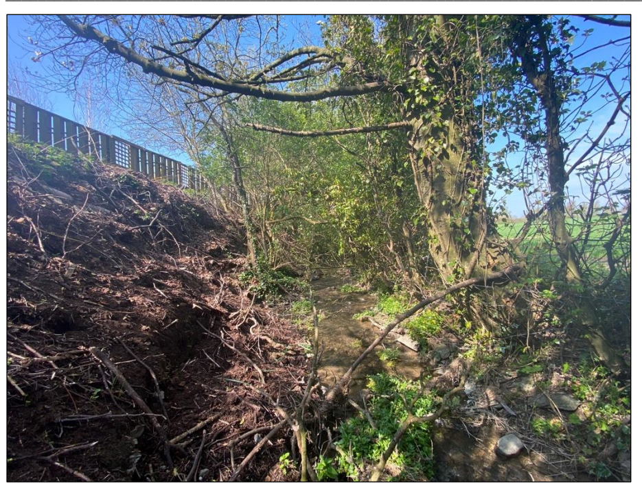
Plate 3 The upstream side showed clear evidence of recent vegetation clearance and debris.