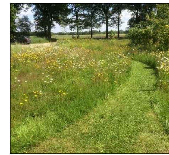
Natural meadow edge to pitches / parkland