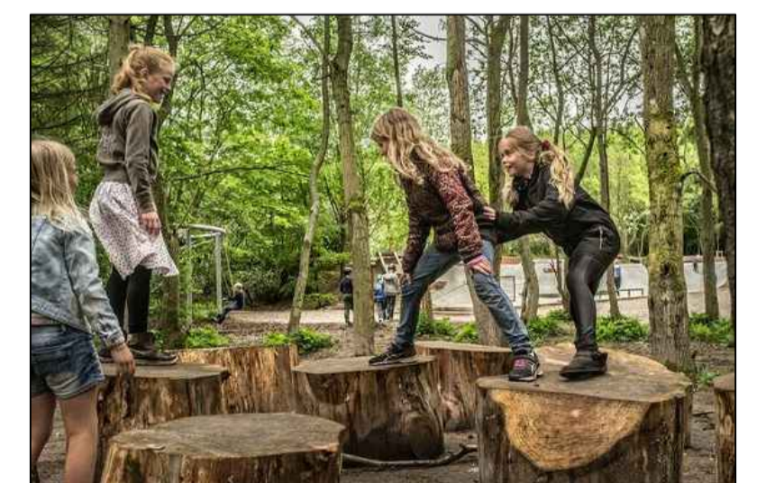
Natural play elements within woodland clearances