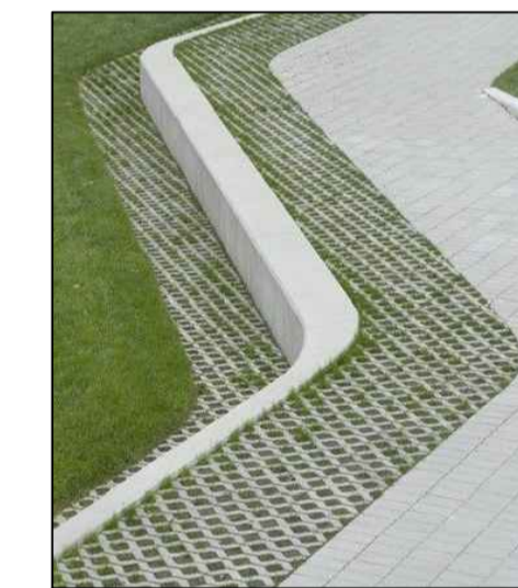
Concrete edge & seating to pitches