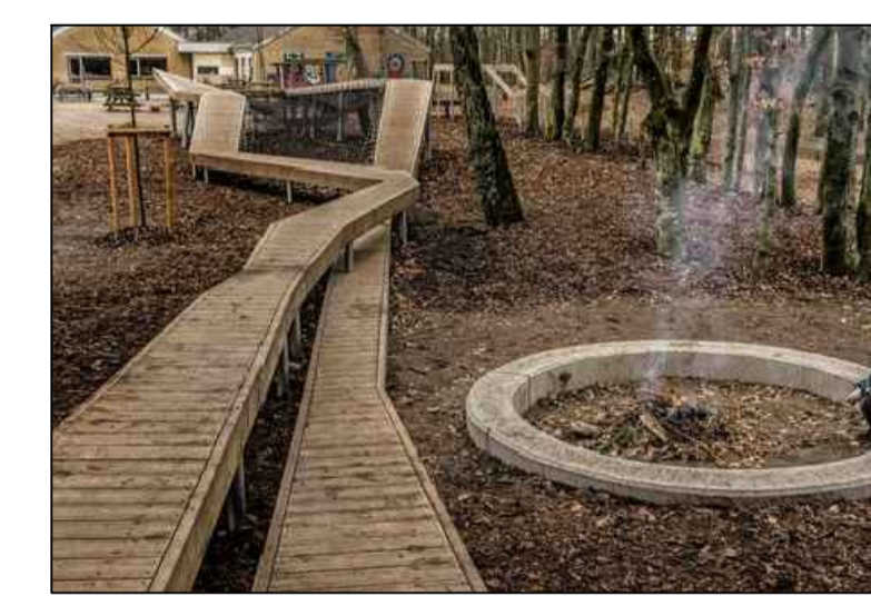
Timber 'play' path set within existing woodlands