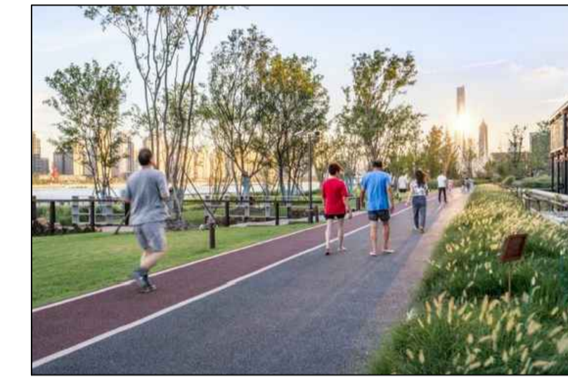
Wide exterior loop path in asphalt finish