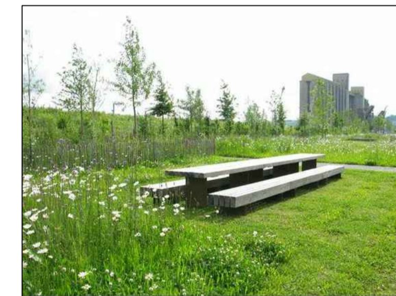
Steel frame and timber picnic sets