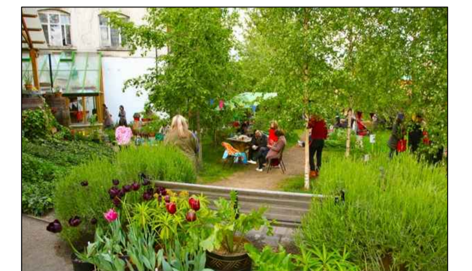
Allotment area with community seating and orchard trees