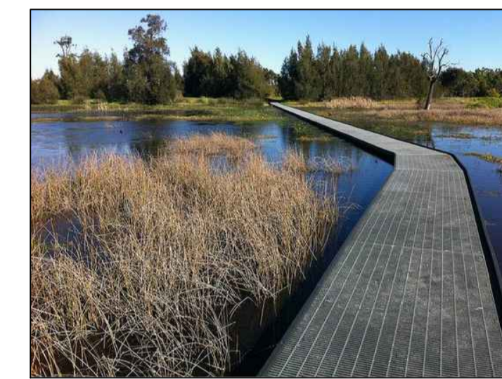
Low impact paths through wetlands areas