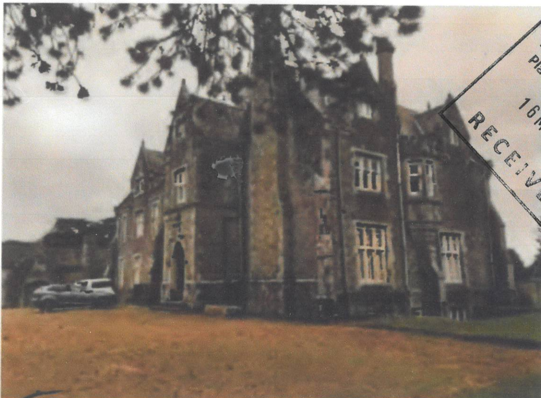
Fig. 4 – Gowran Grange as viewed from the west

RECEIVED Kildare County Council Planning Department 16 MAY 2022