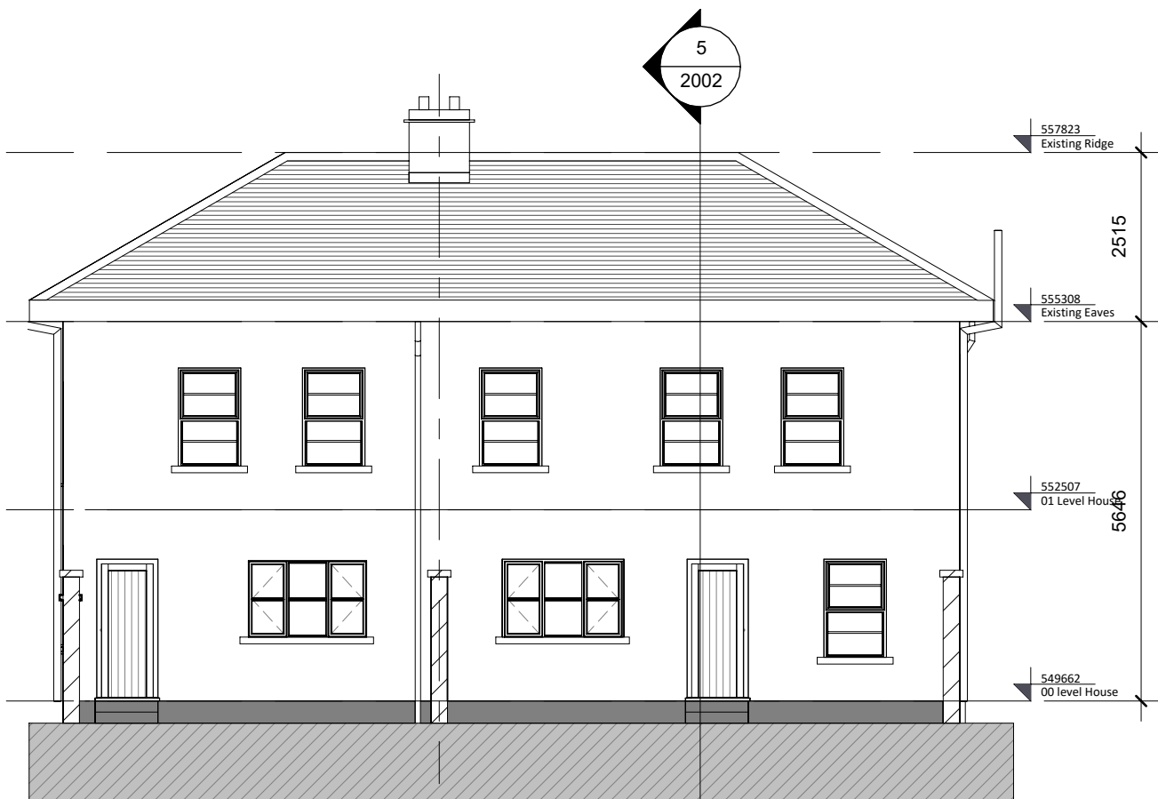
2 Rear Elevation(North) 1 : 100

MEC & ELEC BUILDING TO BE COMPLETELY REWIRED AND PLUMED WITH HEATING SYSTEM MOST LIKELY TO BE AIR TO WATER SYSTEM WITH SOME LEVEL OF HEAT RECOVERY.