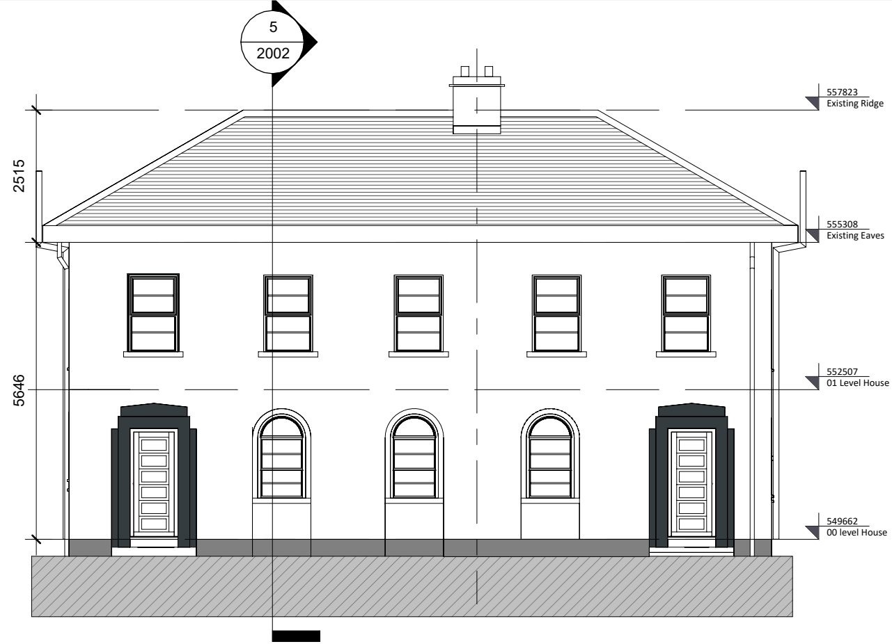
1 Front Elevation(South) 1 : 100