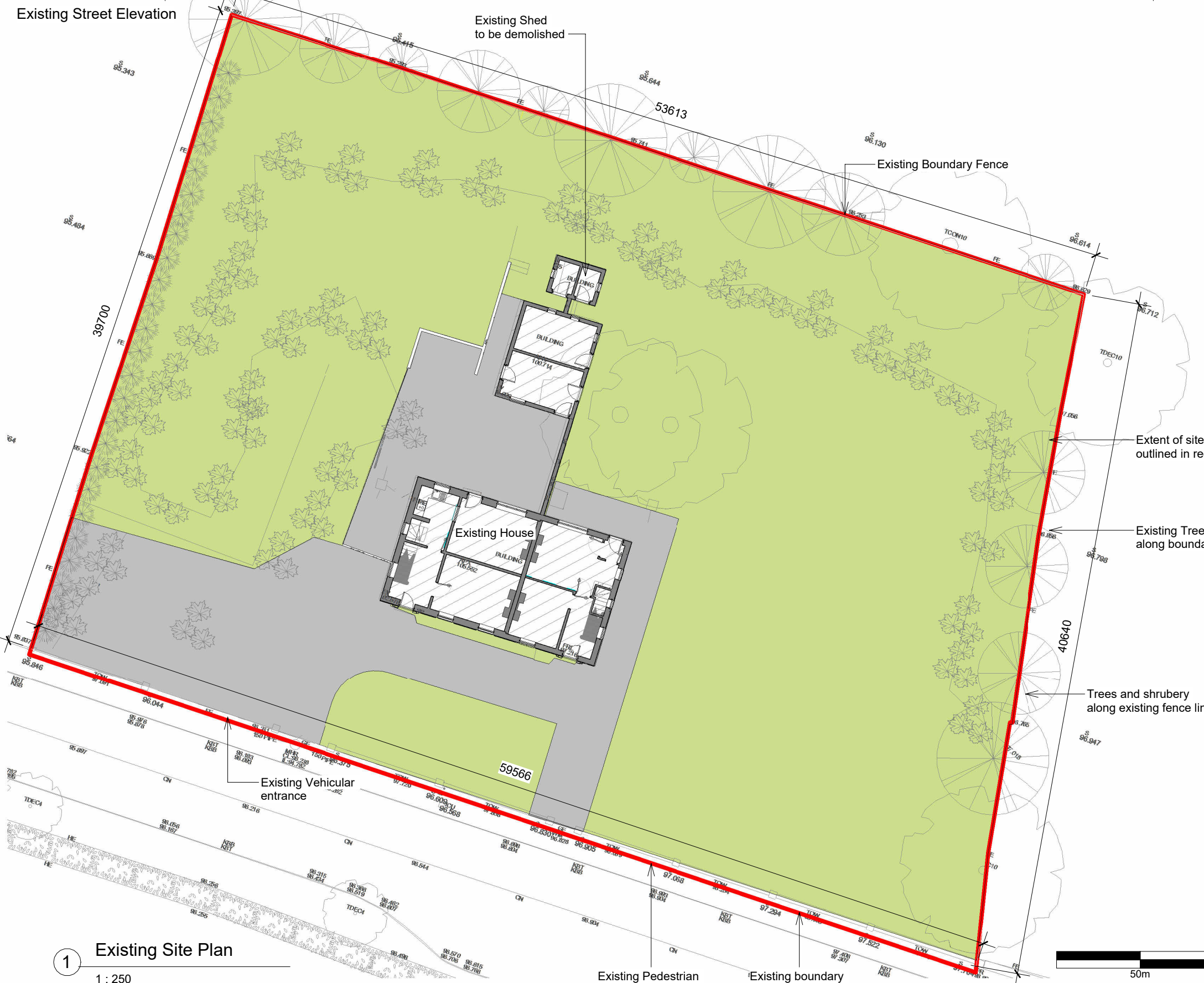
1 Existing Site Plan 1 : 250