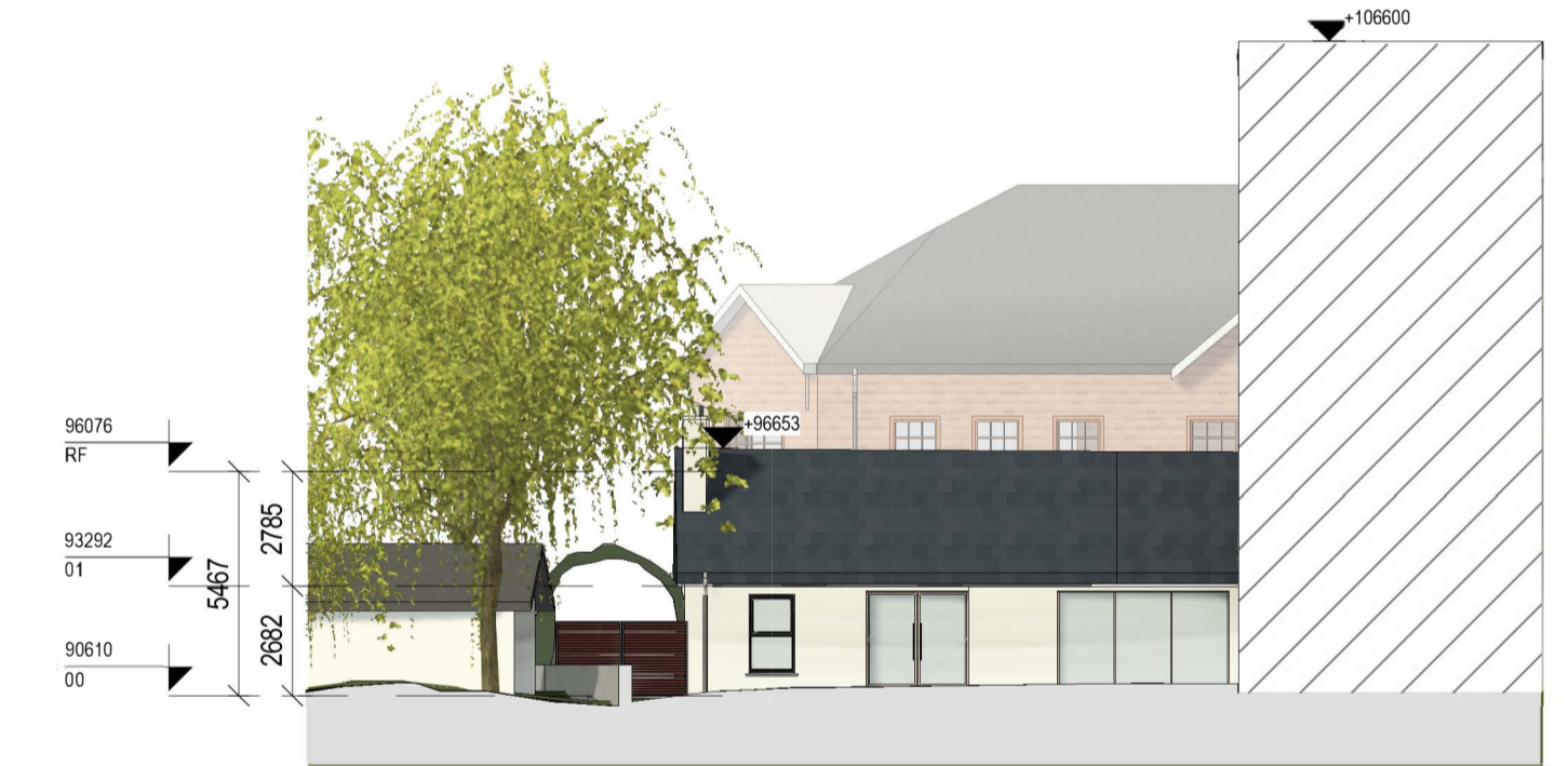
9 Beaufort House - West Elevation Proposed Scale: 1 : 200