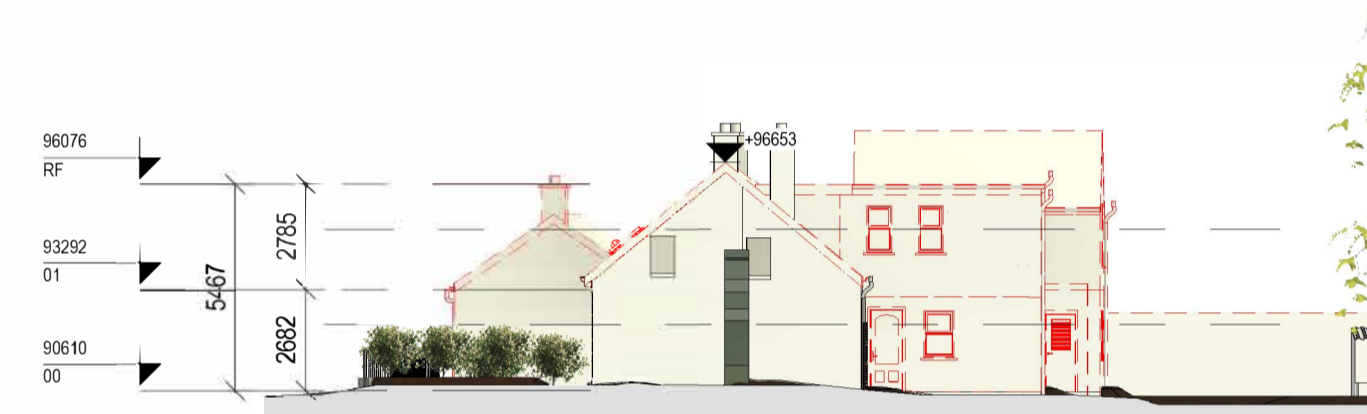
5 Beaufort House - North Elevation Demolished Scale: 1 : 200