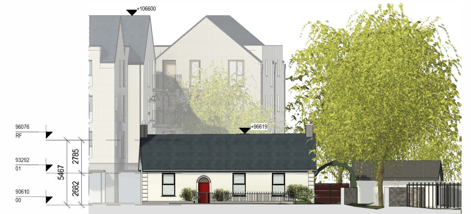
3 Beaufort House - East Elevation Proposed Scale: 1 : 200