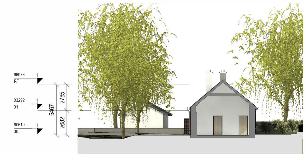
12 Beaufort House - Section 1 Proposed Scale: 1 : 200