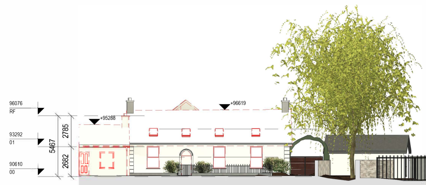
2 Beaufort House - East Elevation Demolished Scale: 1 : 200