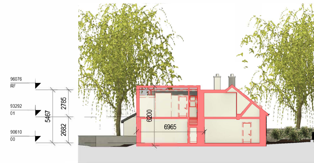
11 Beaufort House - Section 1 Demolished Scale: 1 : 200