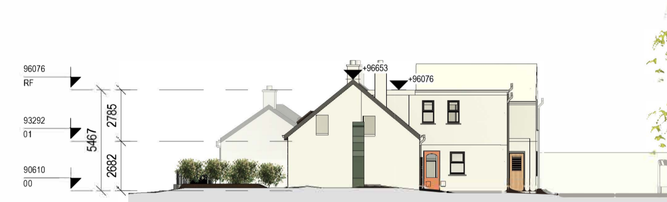
4 Beaufort House - North Elevation Existing Scale: 1 : 200