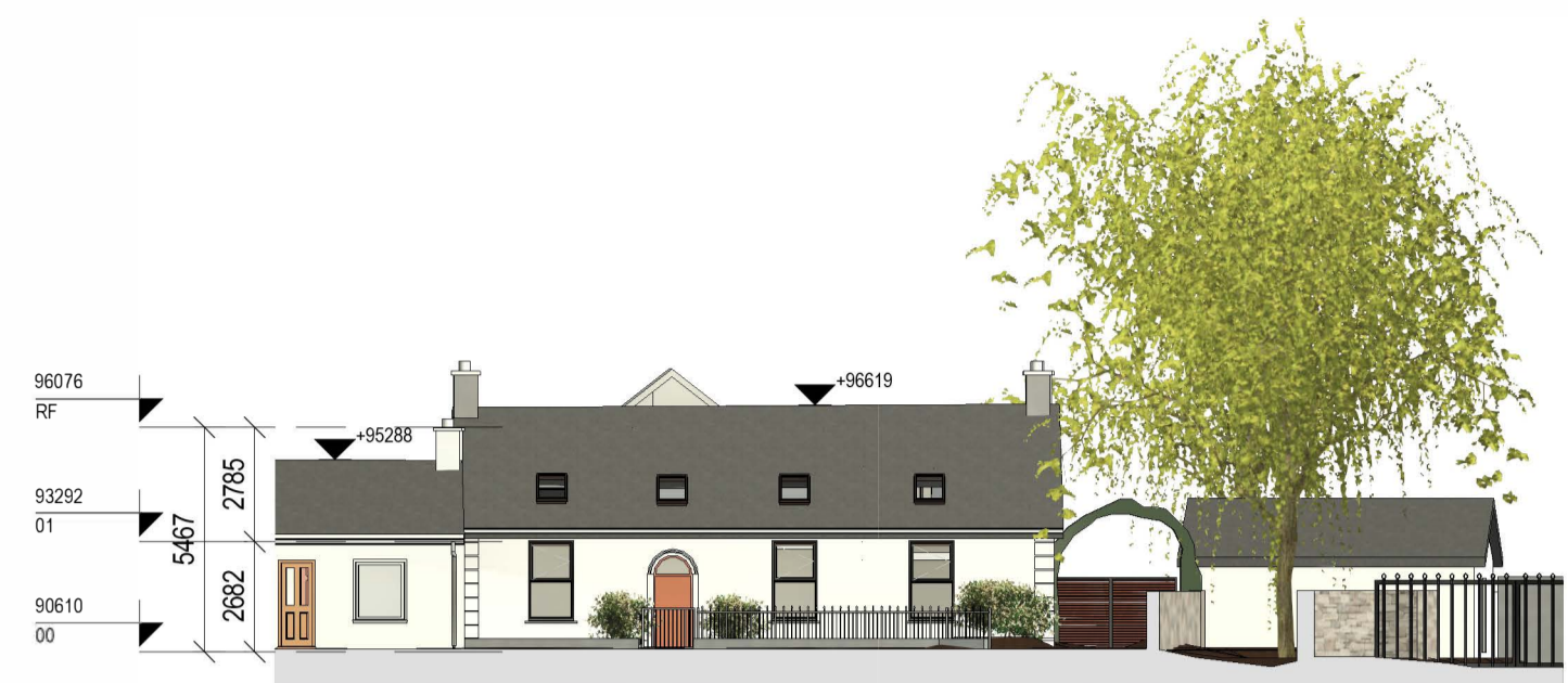
1 Beaufort House - East Elevation Existing Scale: 1 : 200