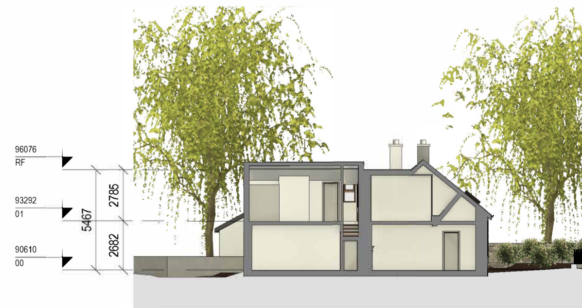
10 Beaufort House - Section 1 Existing Scale: 1 : 200