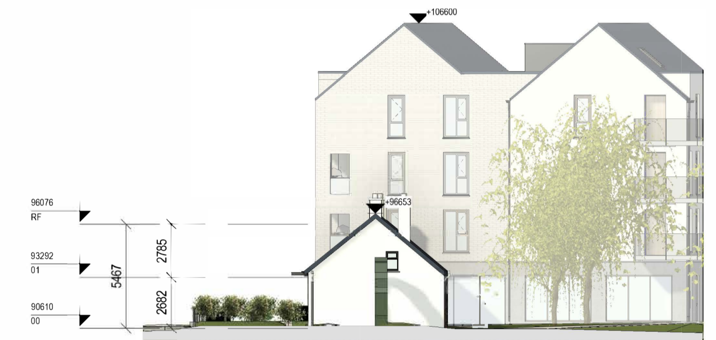
6 Beaufort House - North Elevation Proposed Scale: 1 : 200