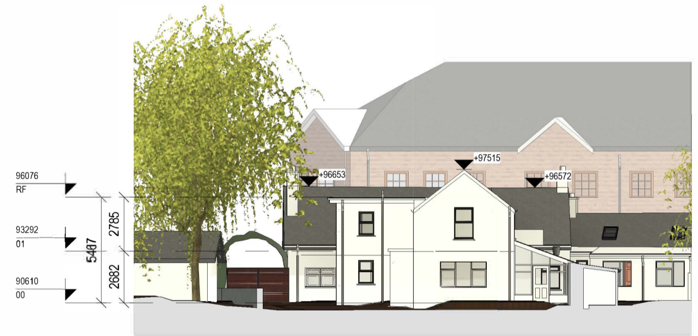
7 Beaufort House - West Elevation Existing Scale: 1 : 200