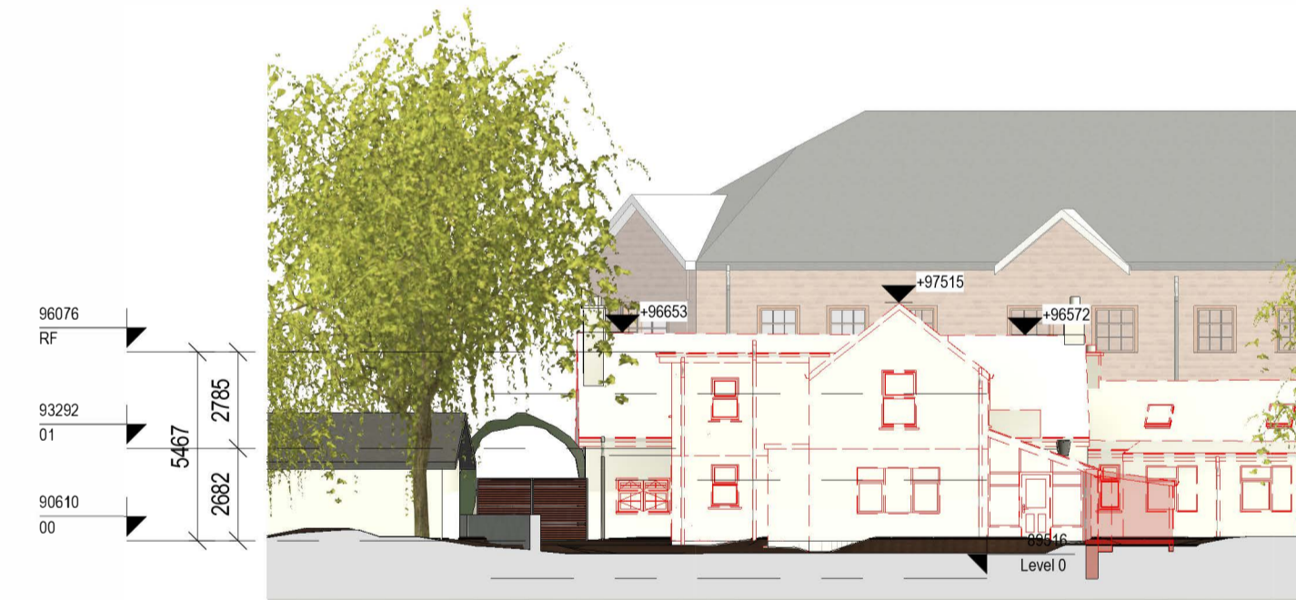
8 Beaufort House - West Elevation Demolished Scale: 1 : 200