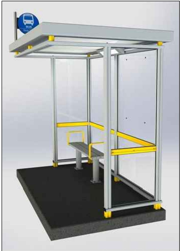
Figure 3a - Bus shelter example '90 Pre-Assembled Shelter'