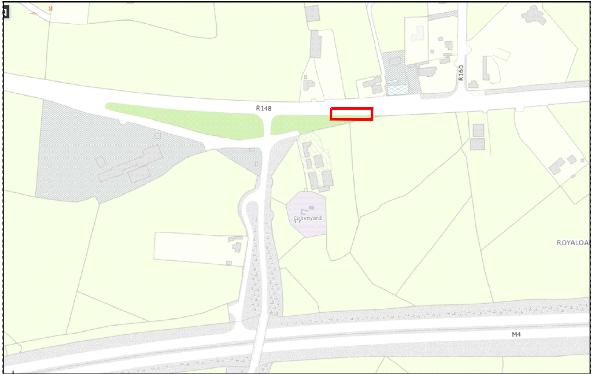
Key Plan - Street Map