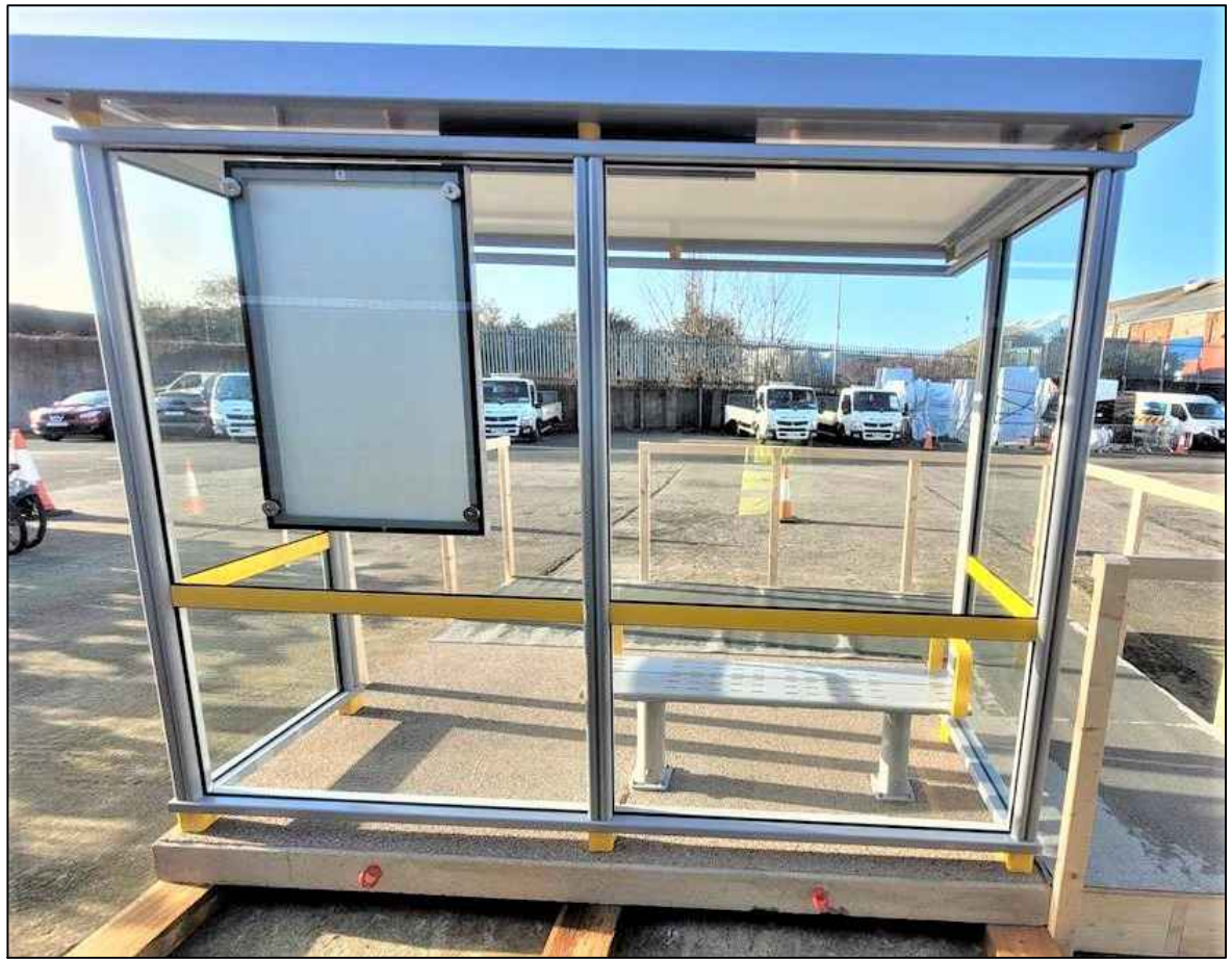
Figure 3b - Bus shelter example 'Pre-Assembled Shelter'