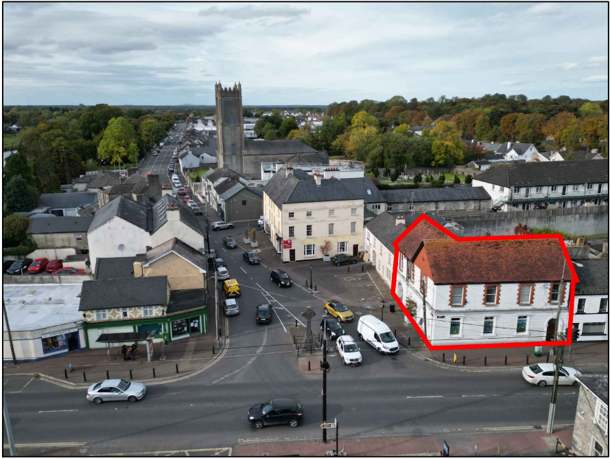
EXISTING AERIAL VIEW - SOUTH NTS