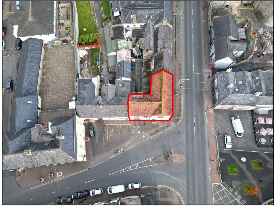
EXISTING AERIAL VIEW FROM THE TOP NTS