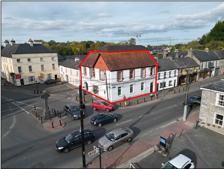
EXISTING AERIAL VIEW - SOUTH WEST NTS