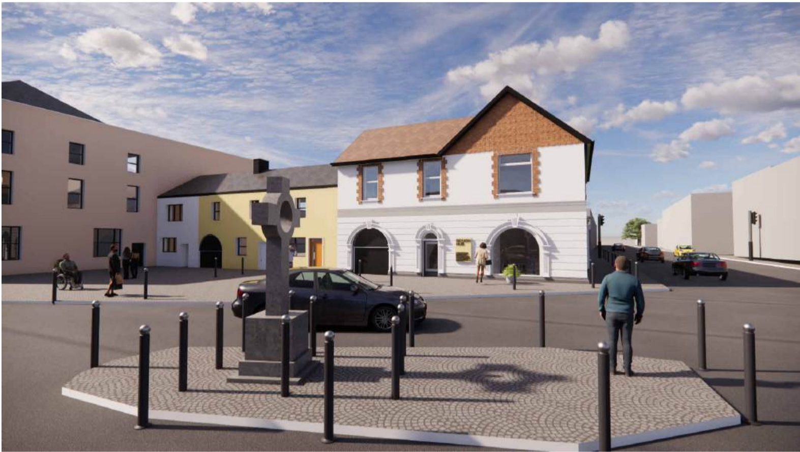
3D VIEW - WEST VIEW