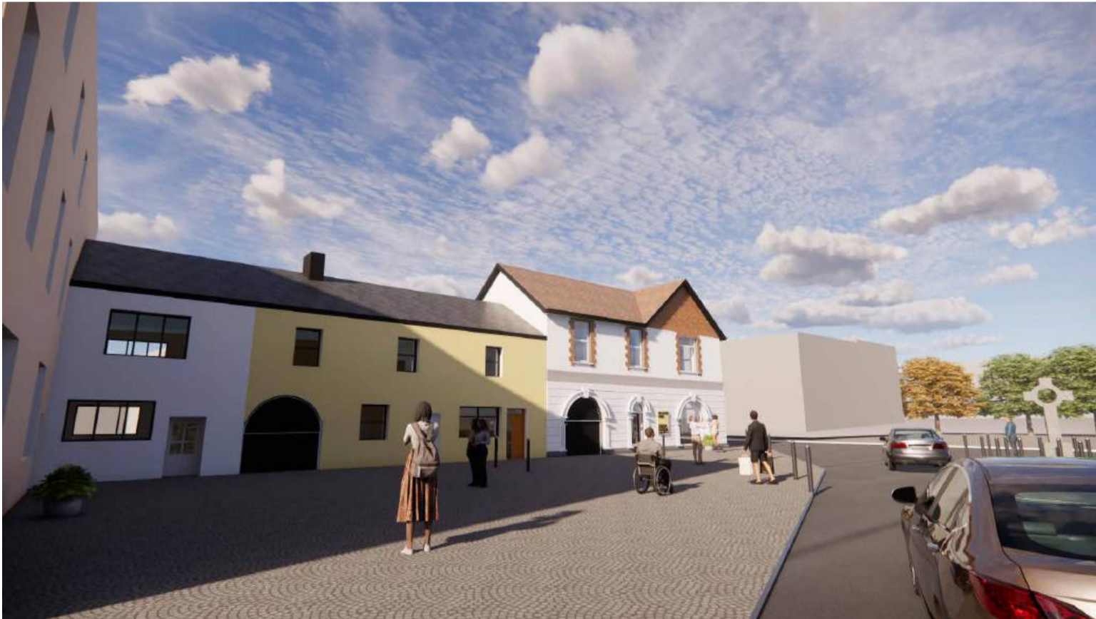
3D VIEW - NORTH WEST VIEW