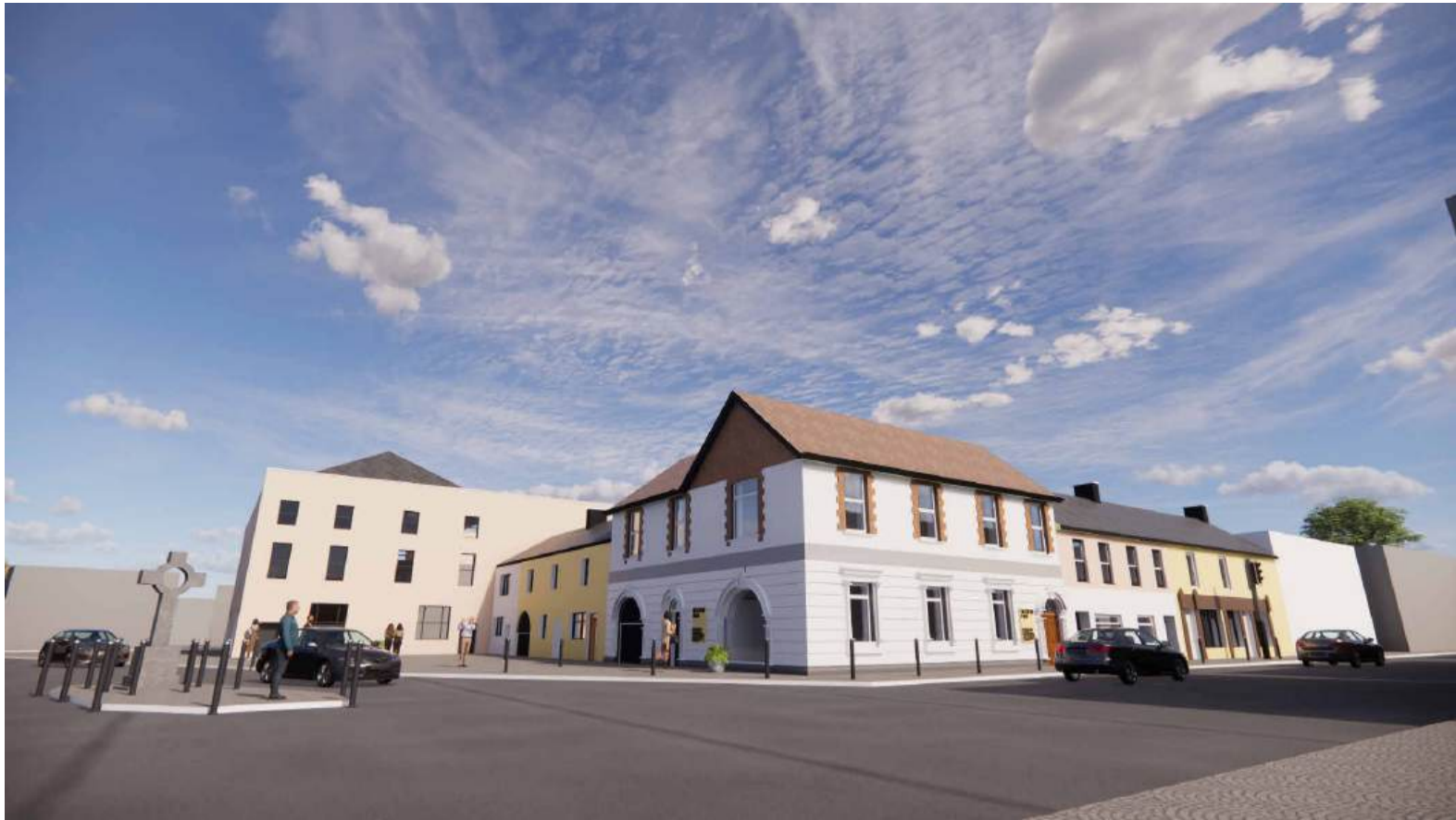
3D VIEW - SOUTH WEST VIEW