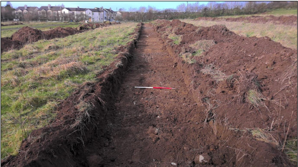
Plate 10: Test trench 13, looking north