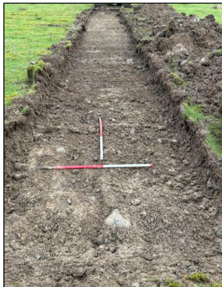
Plate 3: Test trench 4, looking east

This was located at the southwest of the site. The trench was orientated east to west. The trench was excavated to a length of 20m and was 1.8m in width. The topsoil was shallow measuring between 0.3m in depth. Below this the natural was recorded, this consisted of an orange boulder clay, with areas of sand and gravel exposed also.