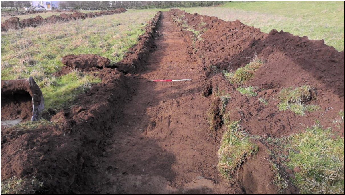
Plate 13: Test trench 15, looking north