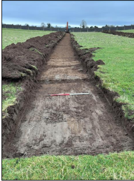
Plate 2: Test trench 2, looking east