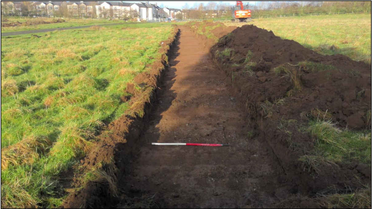
Plate 9: Test trench 12, looking north