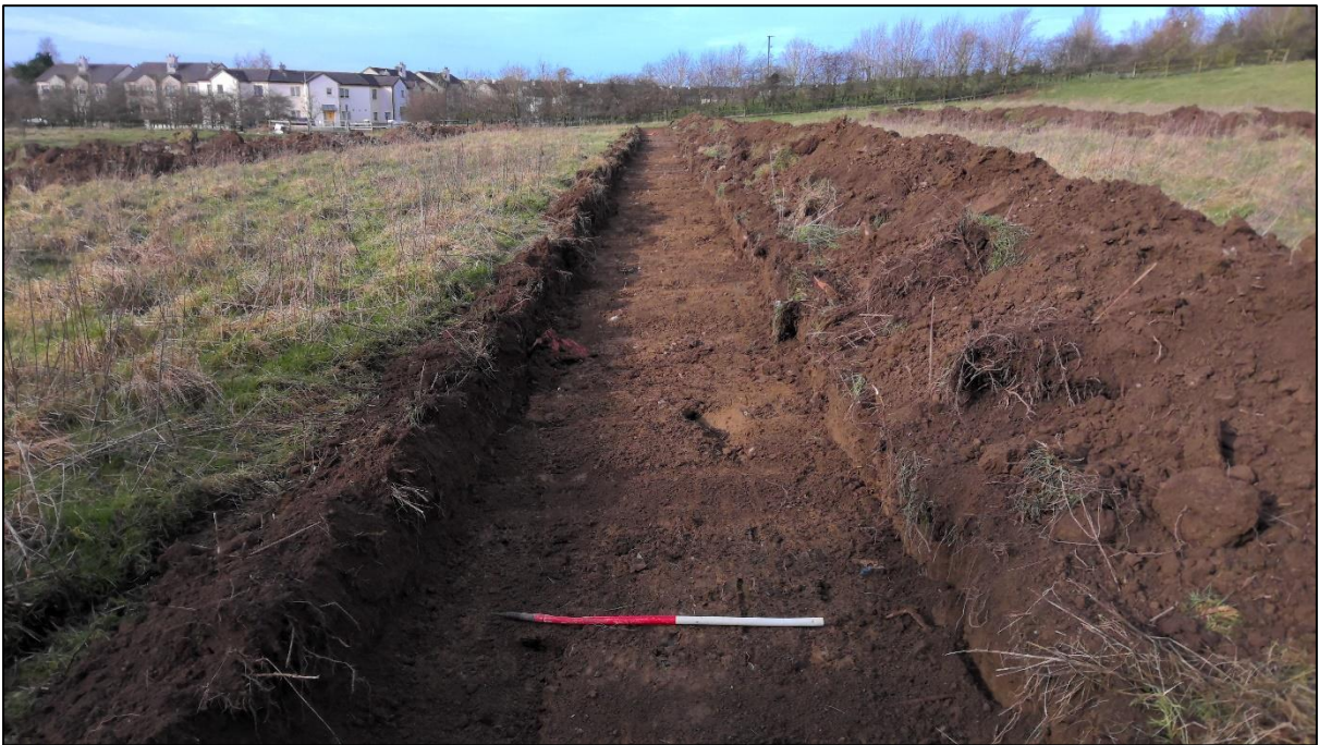
Plate 12: Test trench 14, looking north