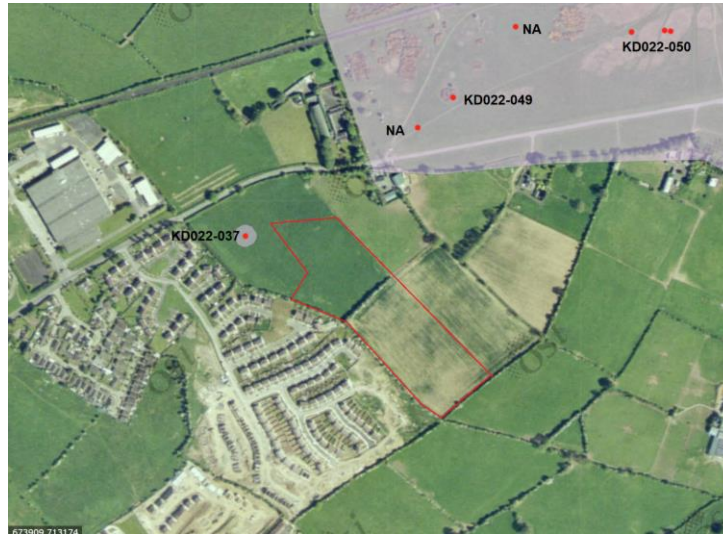
Figure 2: Site boundary with archaeological monuments marked