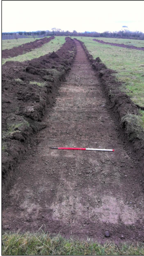
Plate 5: Test trench 6, looking south