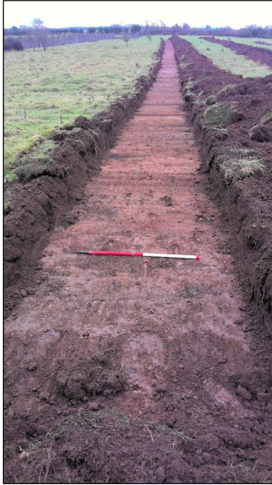
Plate 6: Test trench 7, looking south