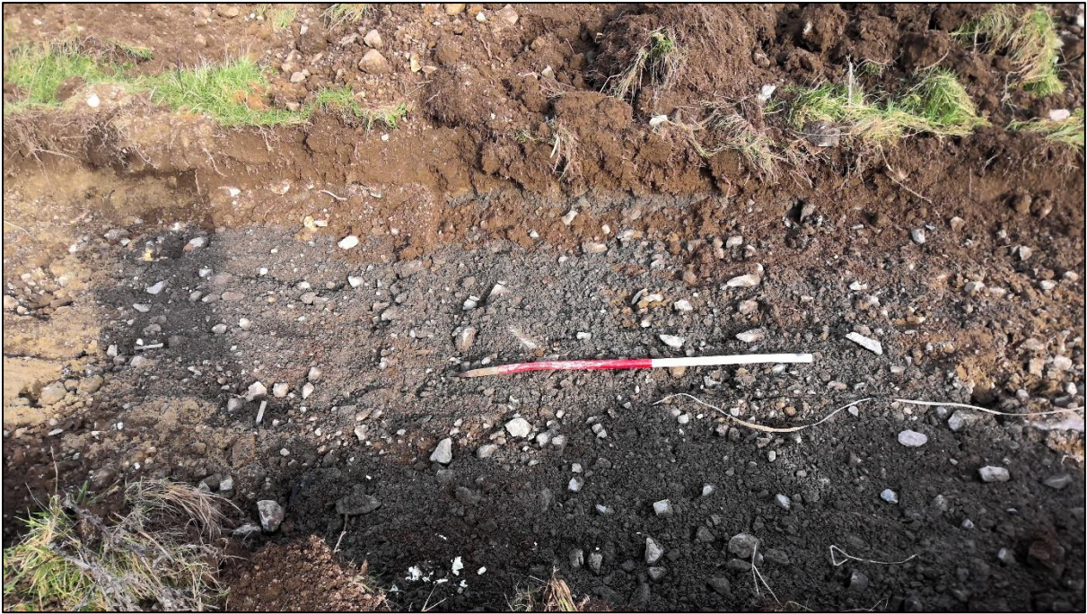
Plate 11: Test trench 13, buried spoil