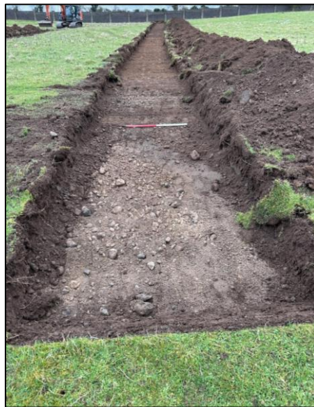
Plate 1: Test trench 1, looking east

These were located at the south of the site. The trenches were orientated east to west. The trenches were excavated to a length of 80m in length and were 1.8m in width. The topsoil was shallow measuring between 0.2-0.3m in depth. Below this the natural was recorded, this consisted of an orange boulder clay, with areas of sand and gravel exposed also.