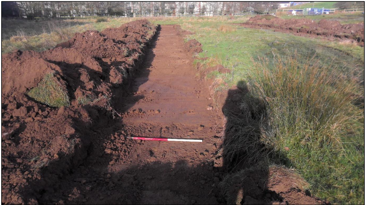
Plate 7: Test trench 9, looking north

Test trench 11 could not be excavated due to the location of two pipelines connecting to the water works at the south of the site.