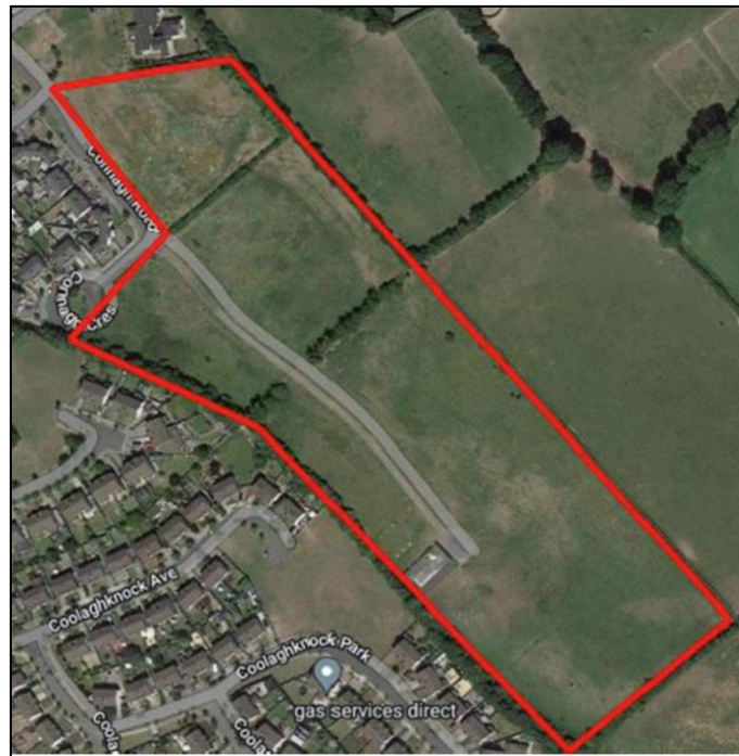
Figure 1: Location of development

The report is based on documentary and cartographic research from all available sources including but not limited to the Record of Monuments and Places, the Sites and Monument Records, the topographical files of the National Museum, the Development Plan, local sources, and other literary and documentary references. Previous excavation in the immediate vicinity of the site was also reviewed. Archaeological testing was undertaken in February 2024.