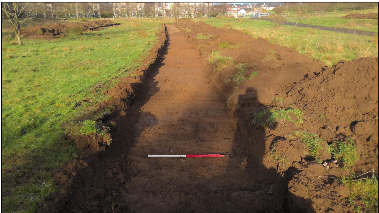
Plate 8: Test trench 10, looking north