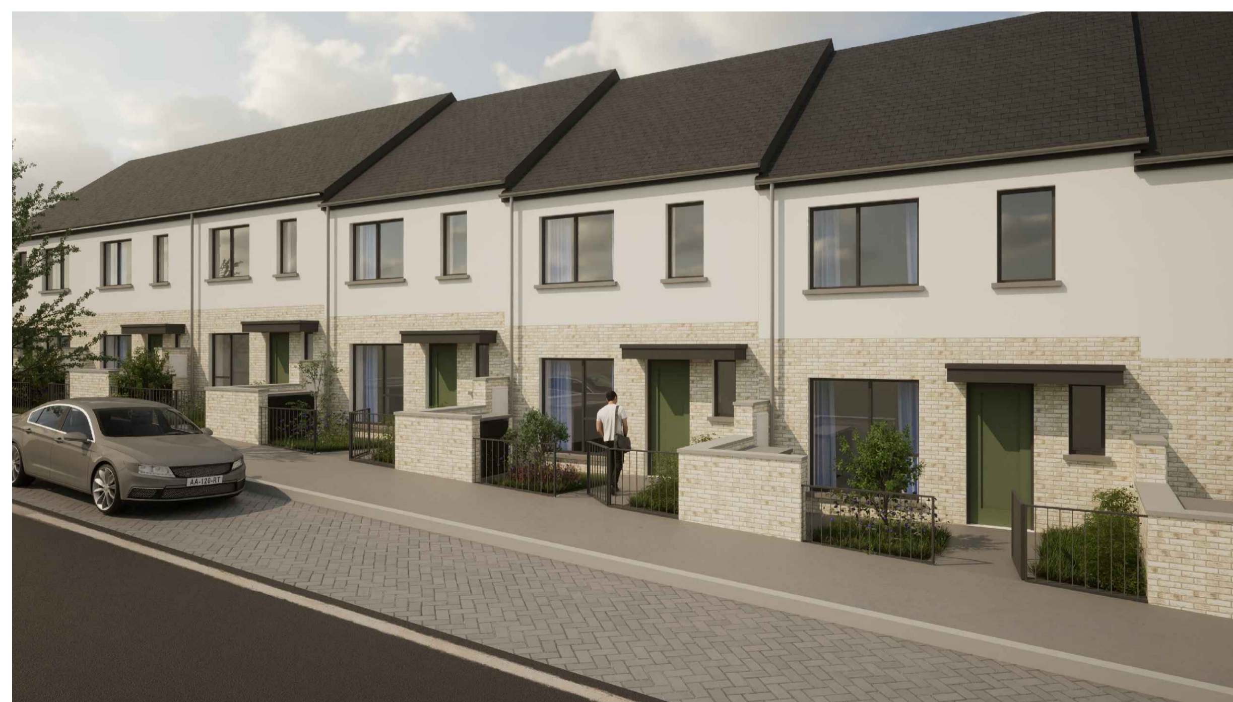
Image of typical curtilage treatment to 2-bed, House Type A