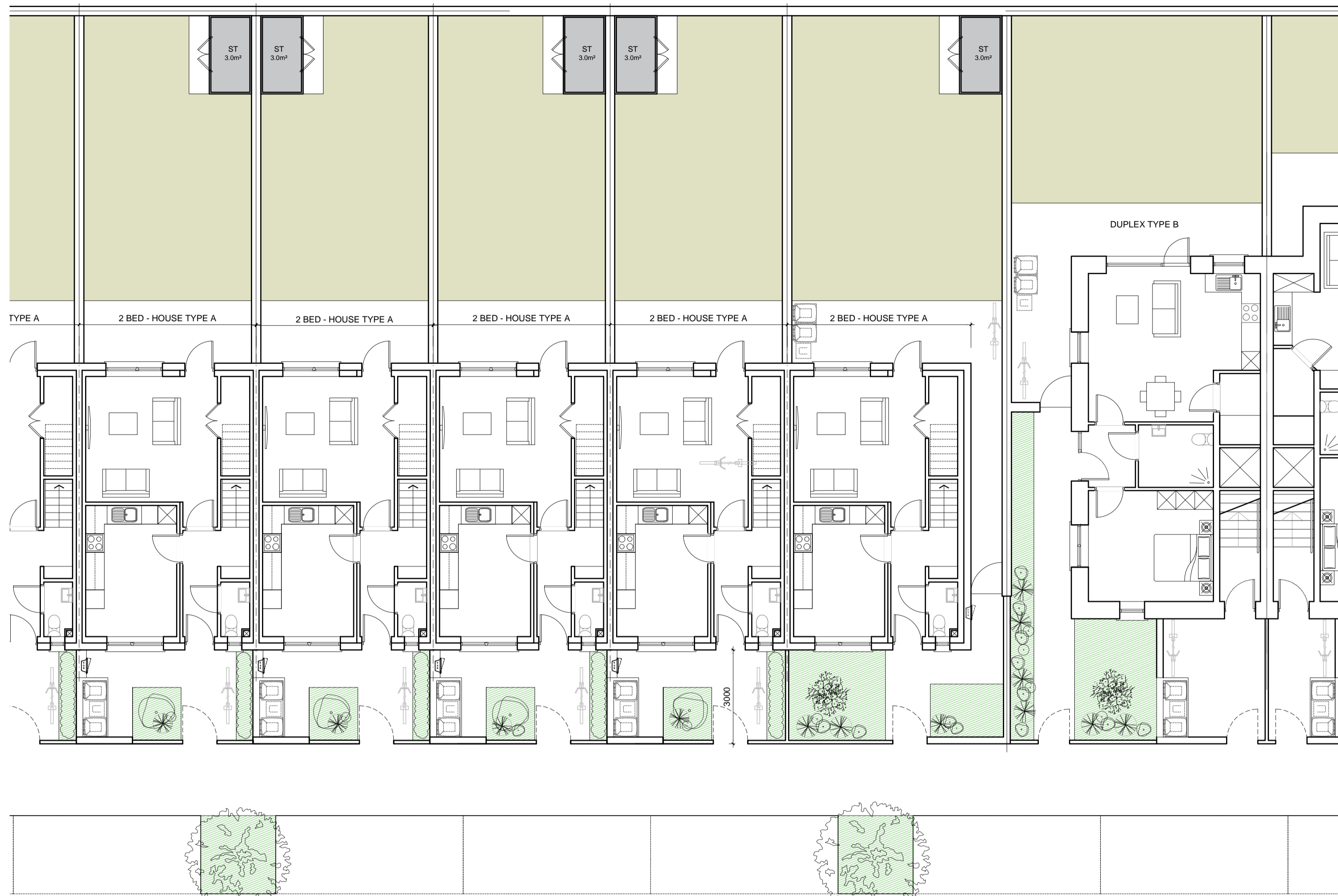
Typical Curtilage Detail - Refer to Key Plan

THIS DRAWING TO BE READ IN CONJUNCTION WITH ALL ARCHITECT'S DRAWINGS, SPECIFICATIONS CONSULTANT'S DESIGN TEAM DRAWINGS AND SPECIFICATIONS.