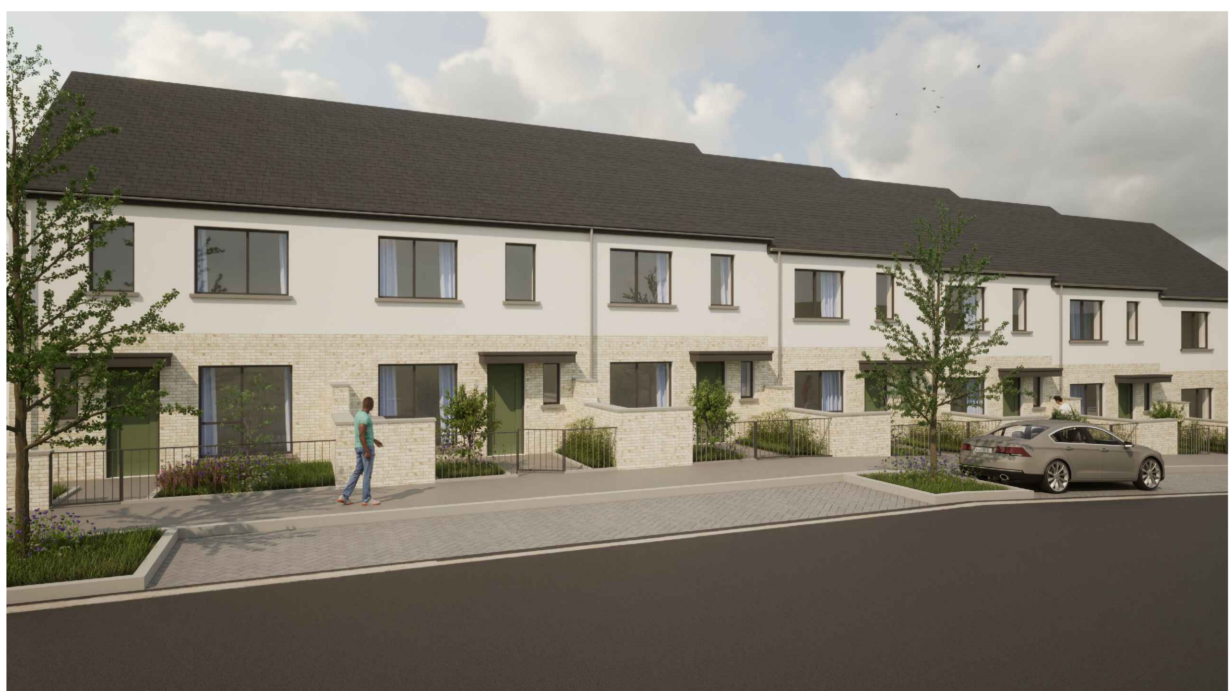
Image of typical curtilage treatment to 2-bed, House Type A