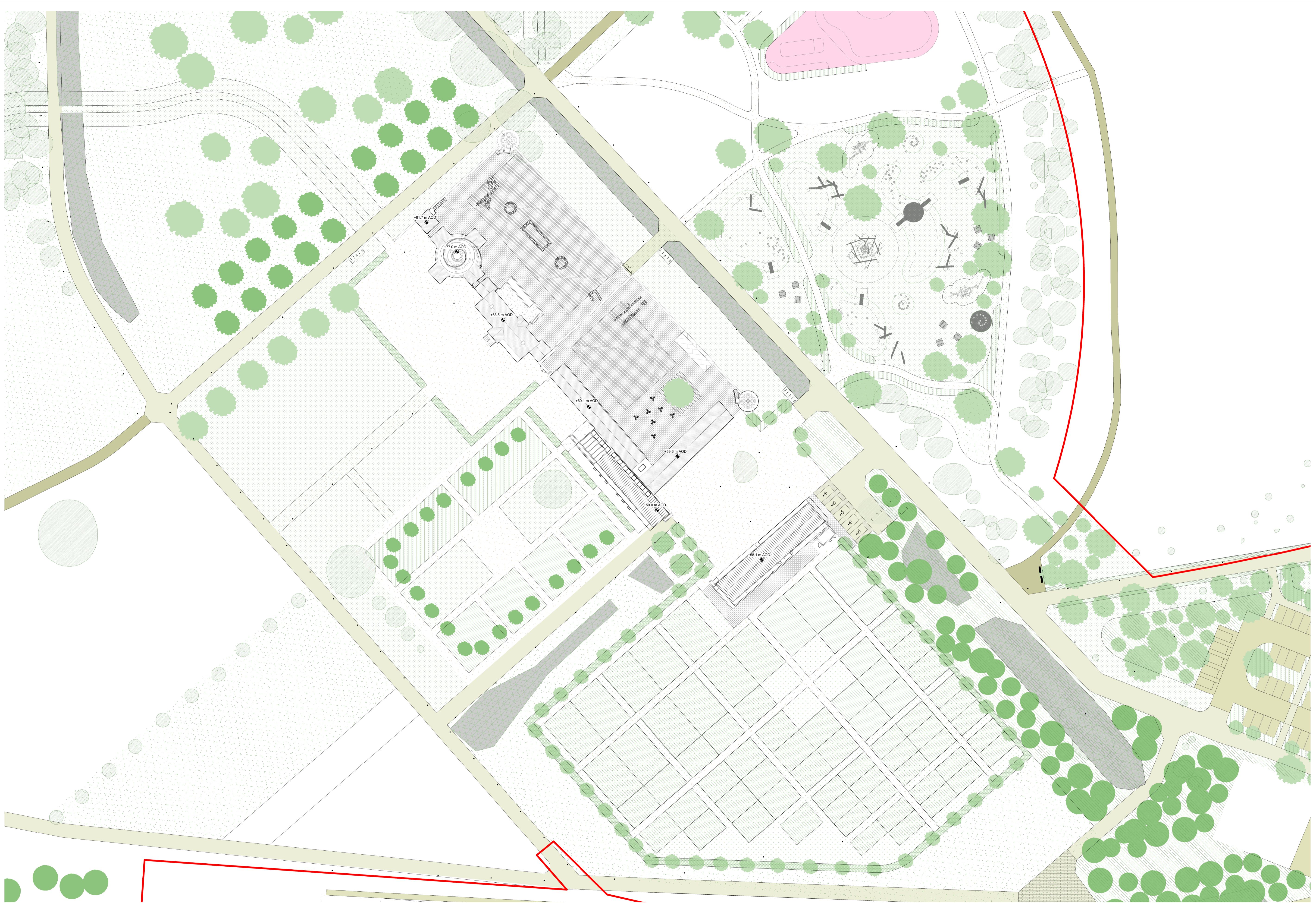
1 ZZ-00-MP-A-Site Layout Plan 2 . 1 : 500