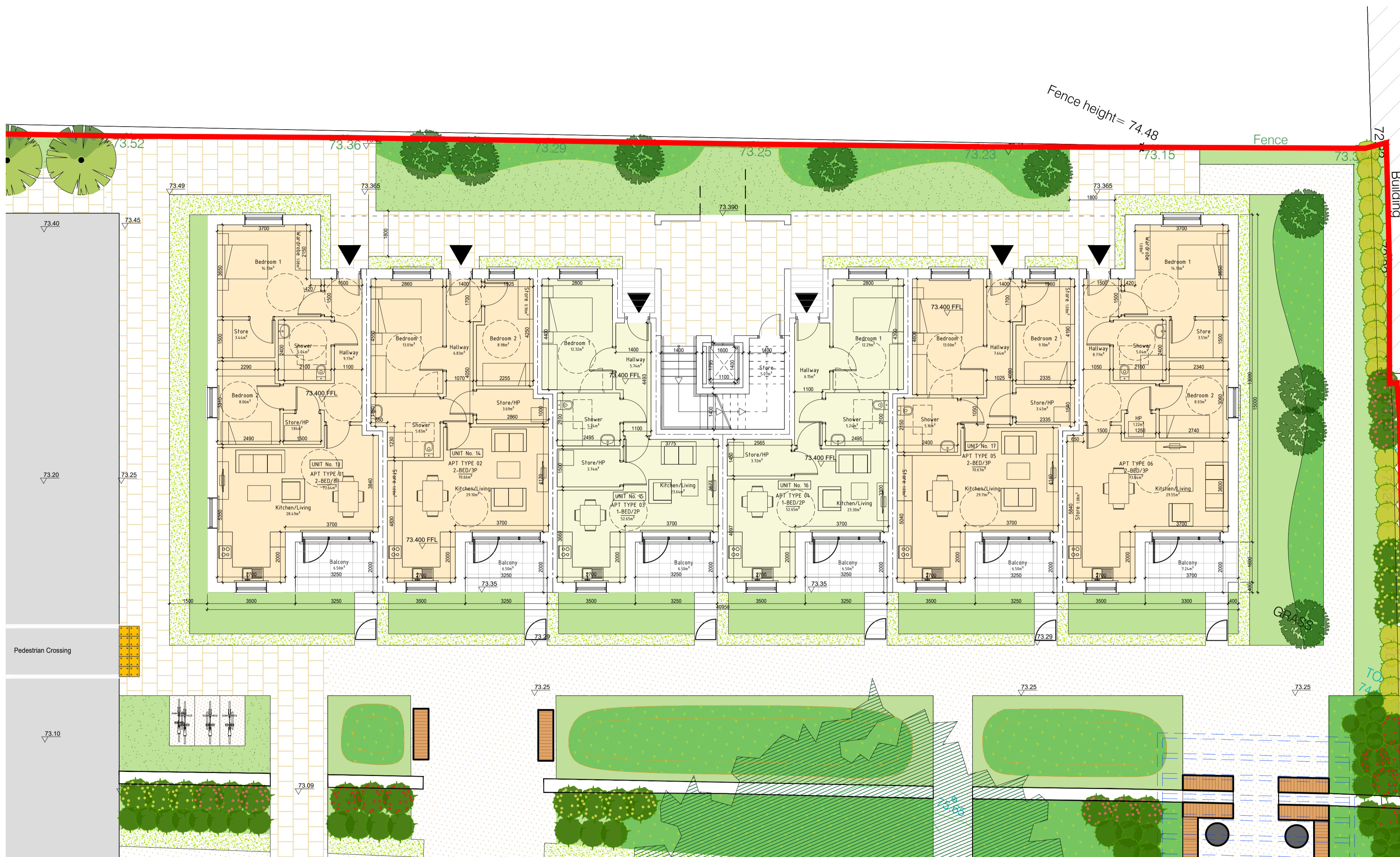
Building B - Proposed Ground Floor Plan Scale 1:100 @ A1