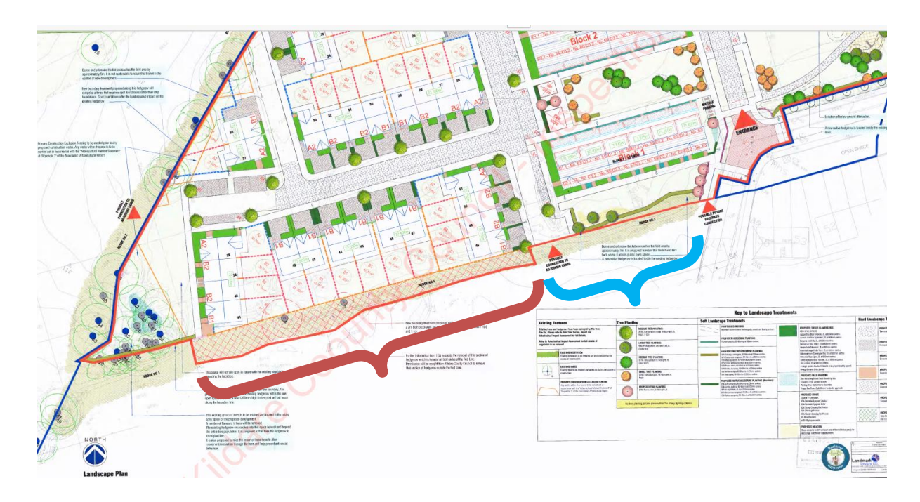
Figure 3. The red marker indicates the section of hedgerow that will be removed as part of planning reference 191282 (refer to Section 5.1), and the blue marker shows the section that will be removed for the proposed development

In summary, the majority of remaining hedgerow within the Site will be retained, and only a small section will be removed. The landscaping scheme for the proposed development will involve the planting of a range of trees and shrubs, which will compensate for the loss of 50 m of fragmented hedgerow. On balance, this compensatory planting will result in a neutral effect on hedgerow habitat.