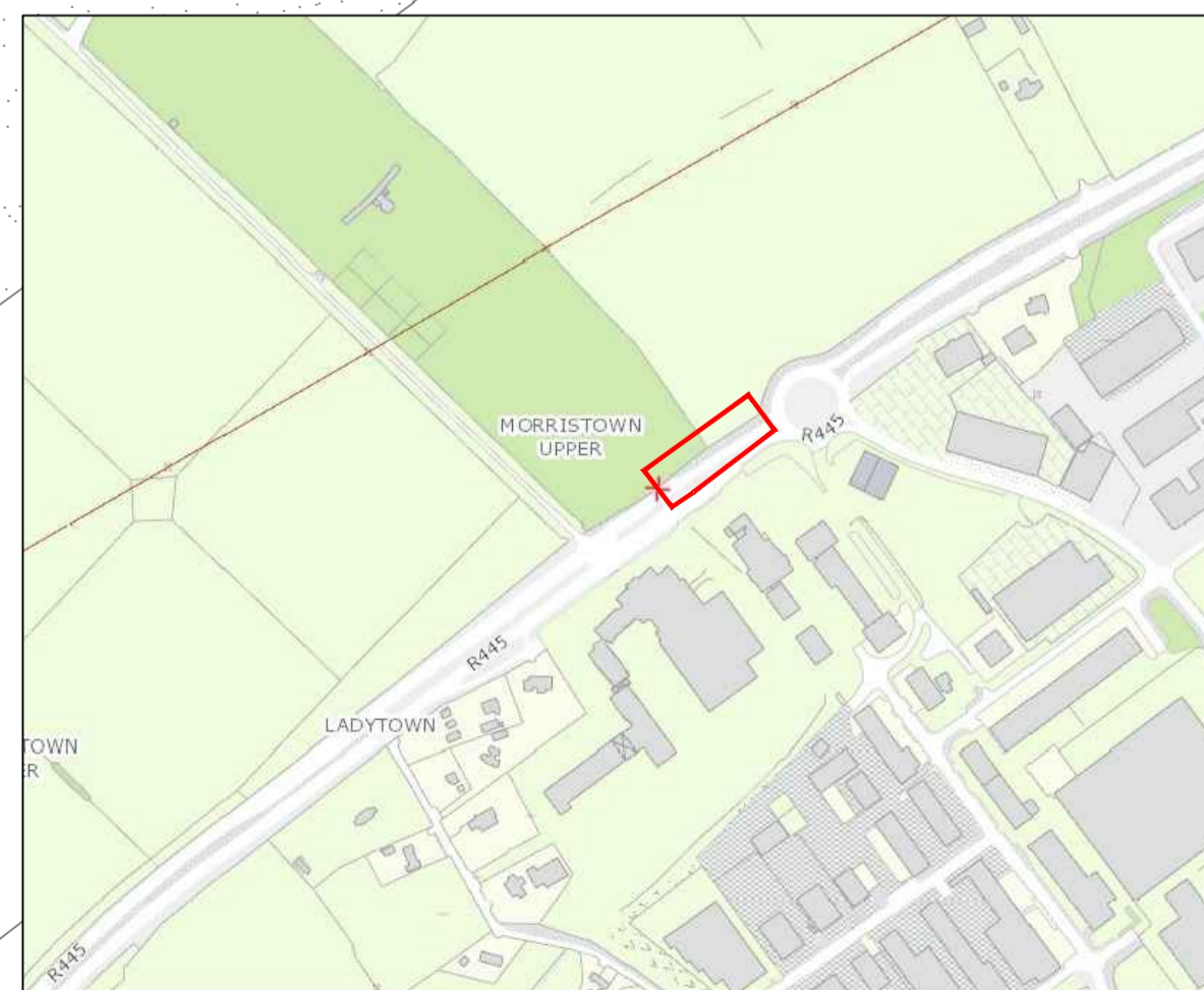
Key Plan - Street Map