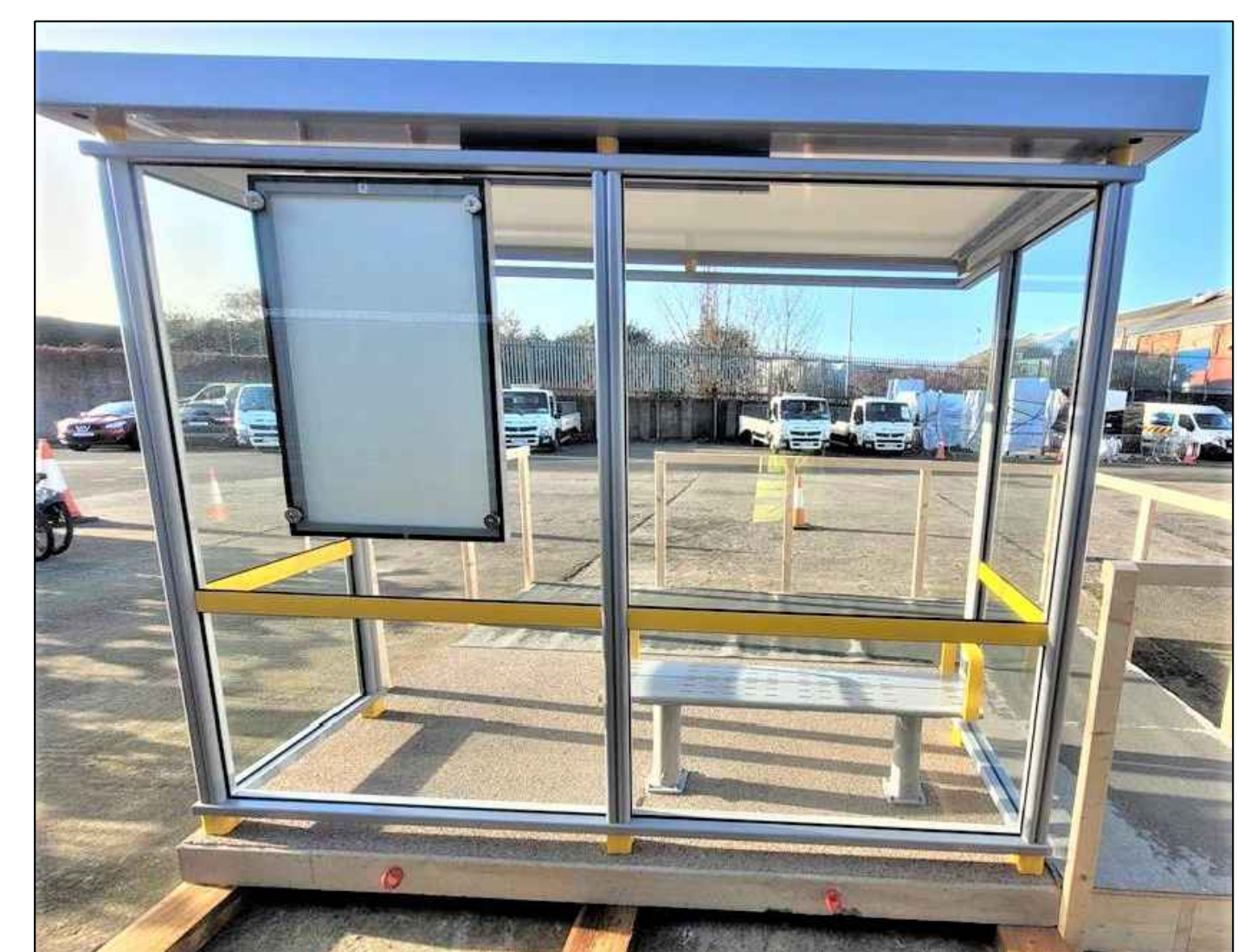
Figure 2 - Bus shelter example "JCDecaux, 2 bay City 90 Pre-Assembled Shelter"