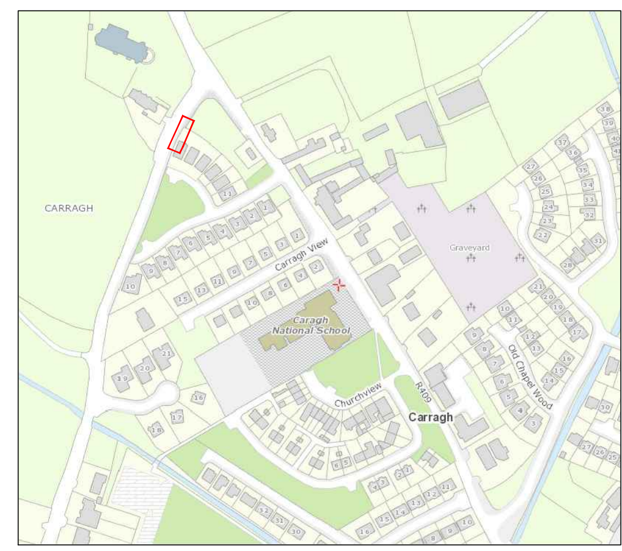
Figure 3 - OSI Identification map