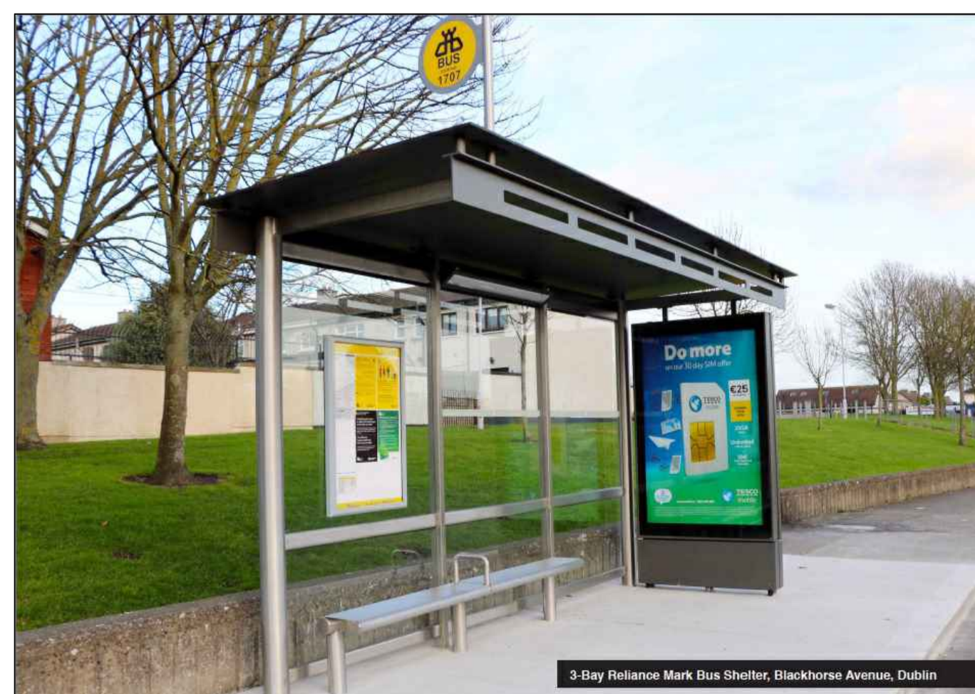
Figure 2 - Bus shelter example