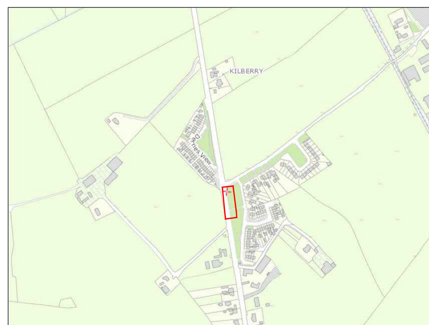
Key Plan - OSI