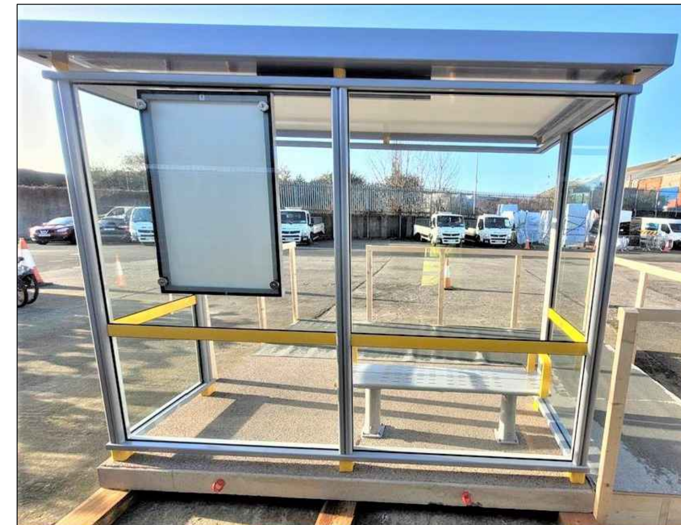
Figure 2 - Bus shelter example