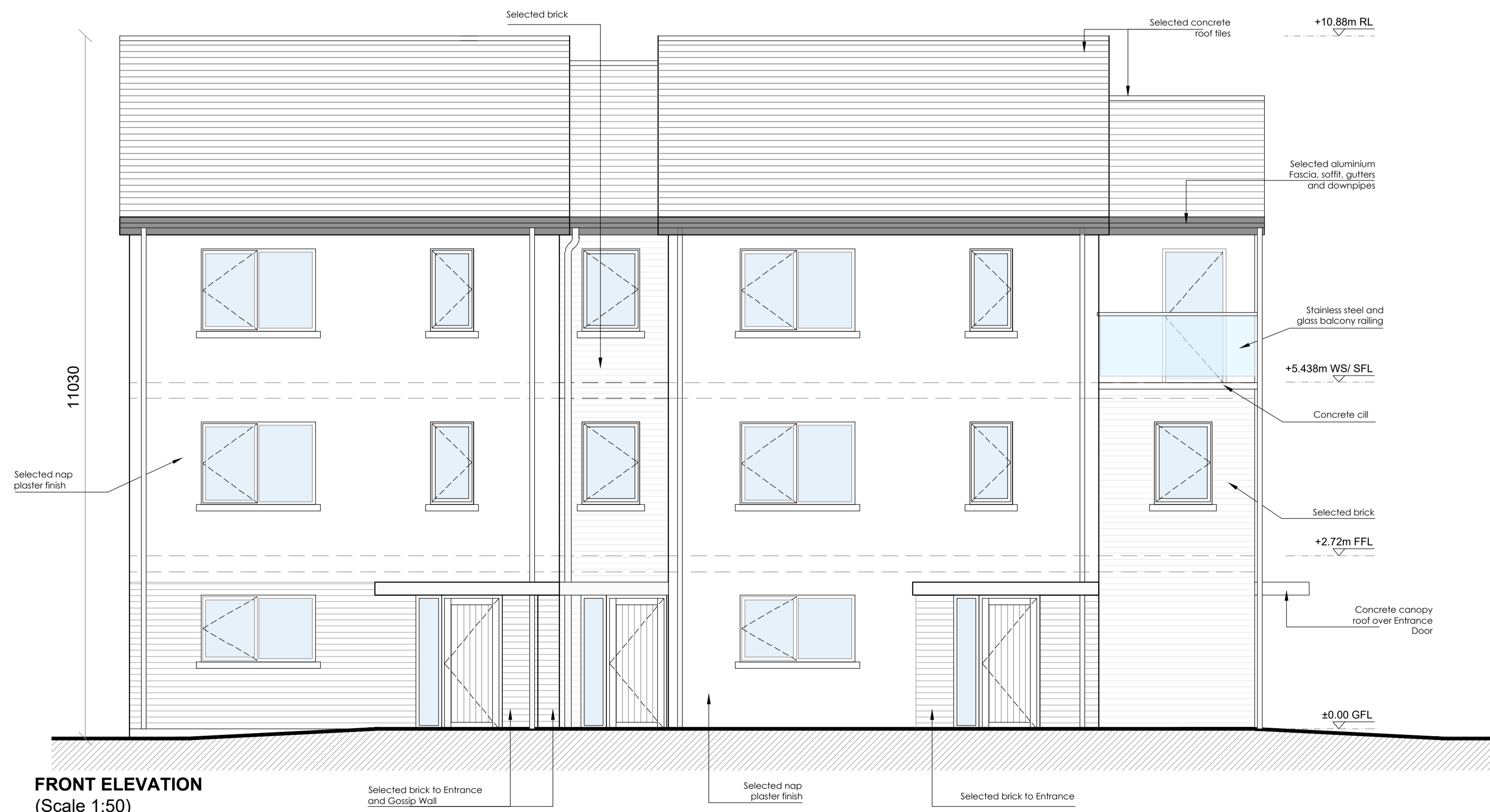
FRONT ELEVATION (Scale 1:50)