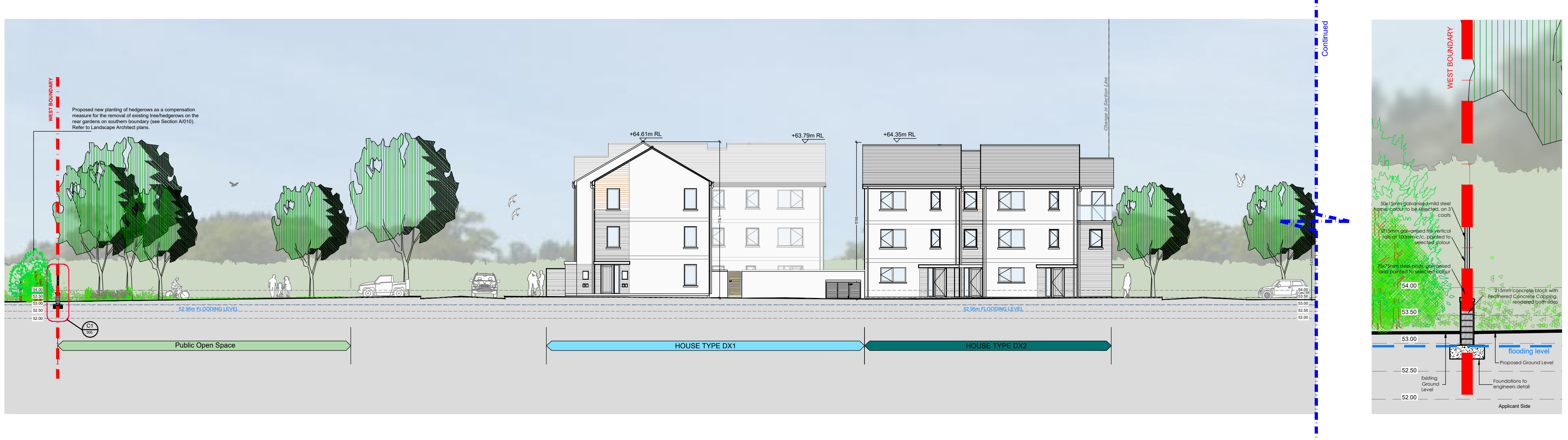
CONTEXT ELEVATION - SECTION C-C (Scale 1:200)