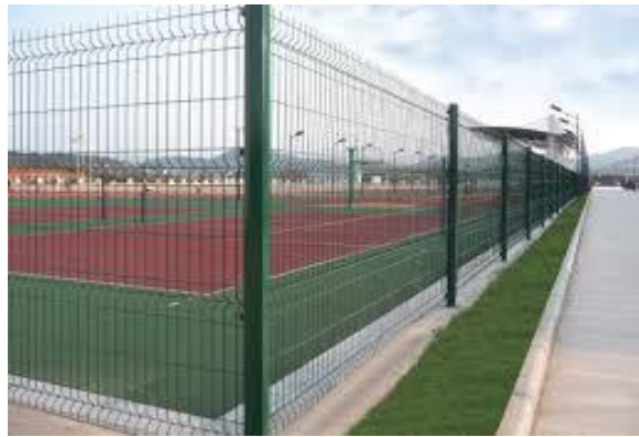
Example of the Type of Fencing Proposed for the Playground Boundary

A double entrance will operate as a pedestrian entrance and service access to the playground. The pedestrian entrance will be 1.8m wide with a self-closing gate and 2.2m gate which will give additional width for maintenance and servicing of the playground.