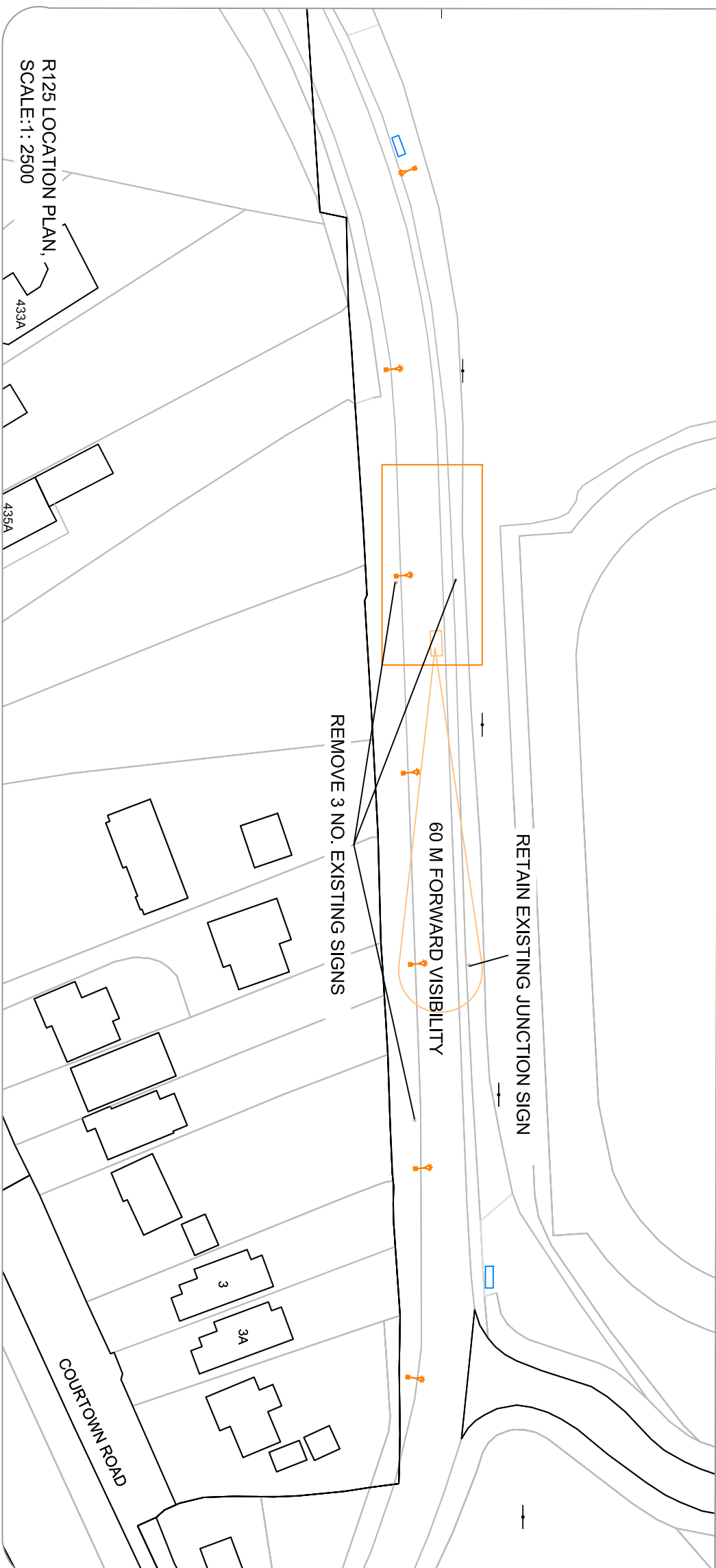
R125 LOCATION PLAN, SCALE:1: 2500

WARNING: BEWARE OF UNDERGROUND SERVICES. THE LOCATIONS OF UNDERGROUND SERVICES ARE APPROXIMATE ONLY AND THEIR EXACT POSITION SHOULD BE PROVEN BY CONTRACTOR ON SITE. NO GUARANTEE IS GIVEN THAT ALL EXISTING SERVICES ARE SHOWN.