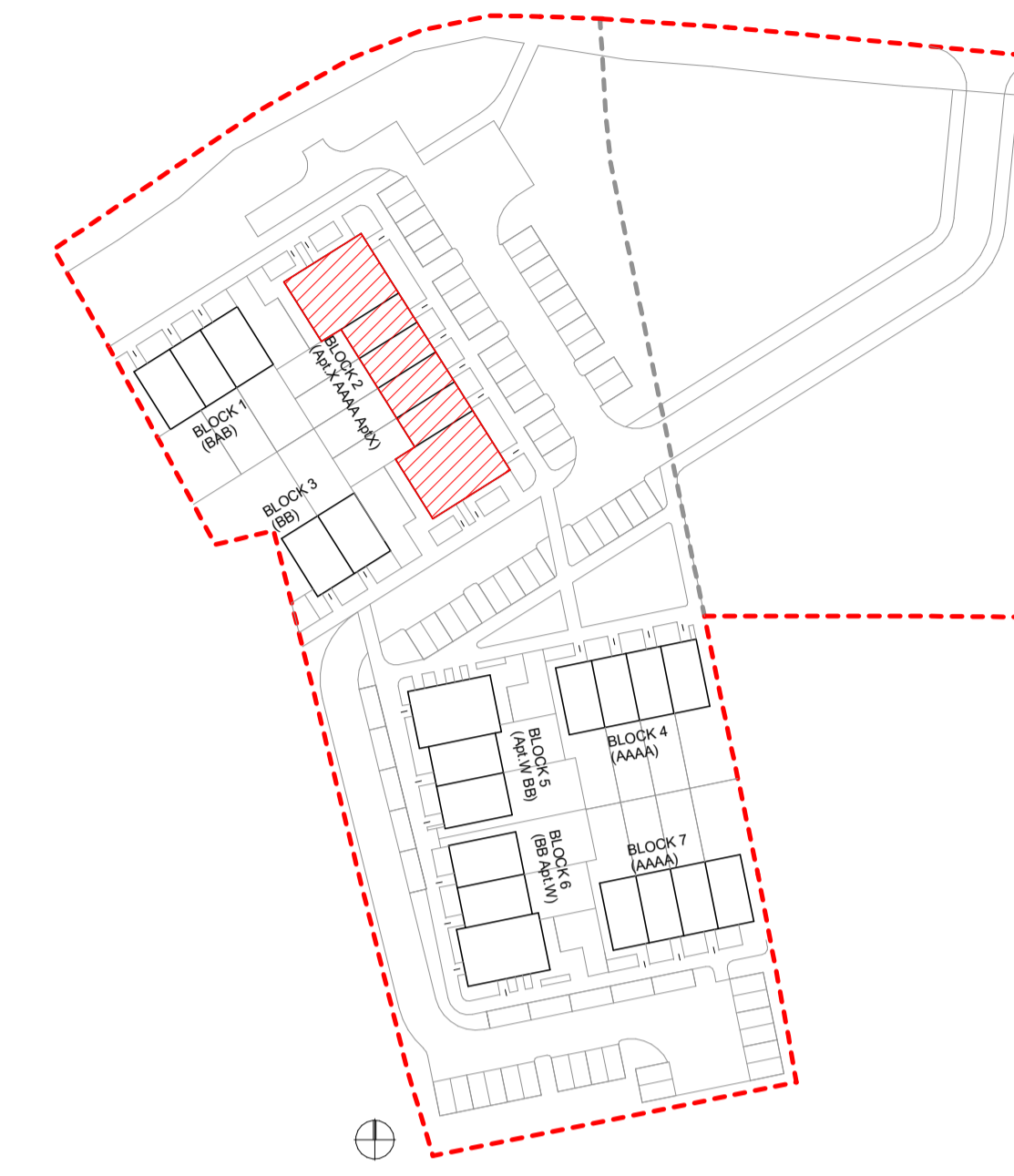
Key Plan 1 : 1000