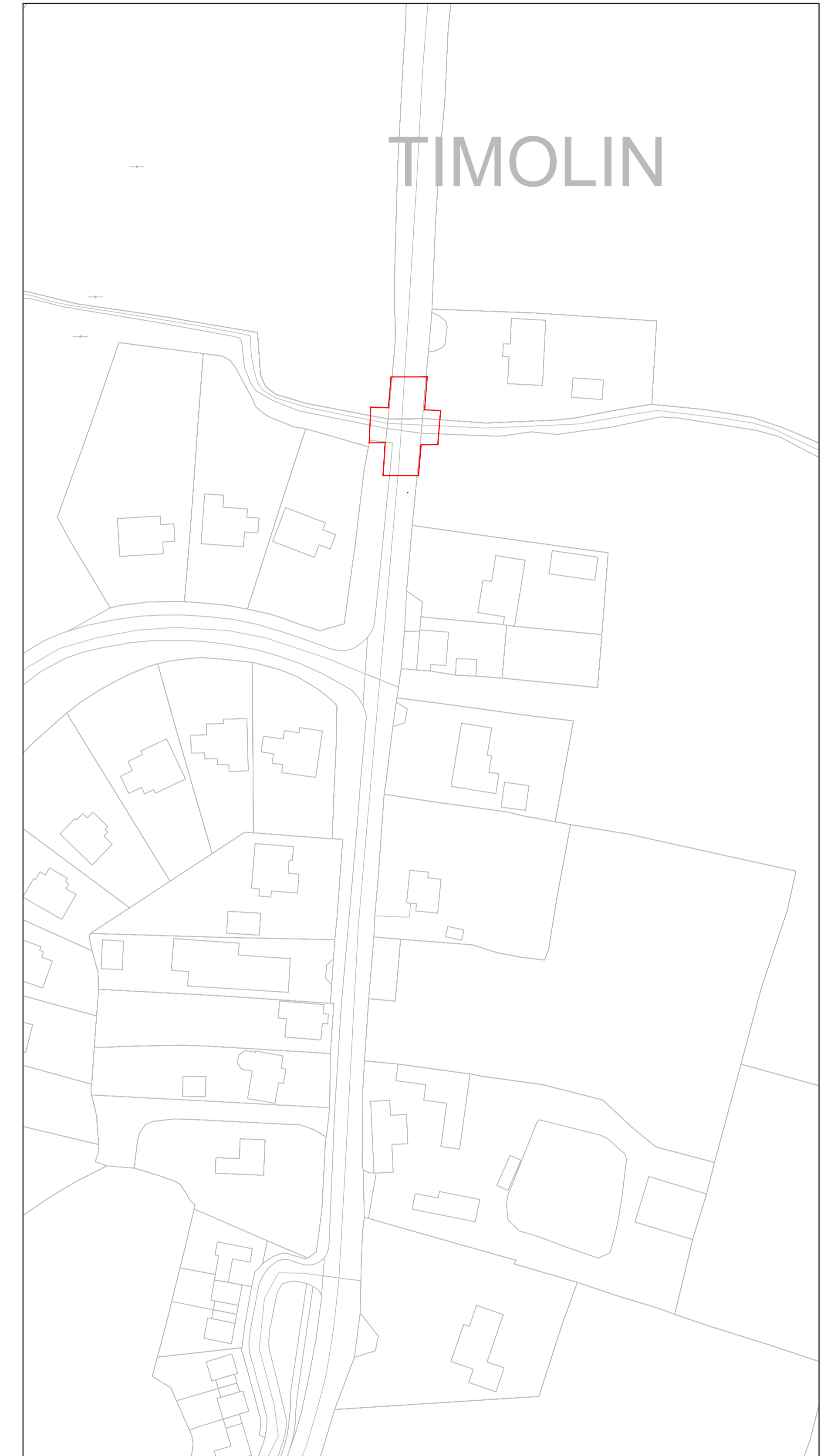
Moone Bridge Site Location NOT TO SCALE

ORDNANCE SURVEY OF IRELAND LICENCE NO. CYALS0213875 © GOVERNMENT OF IRELAND