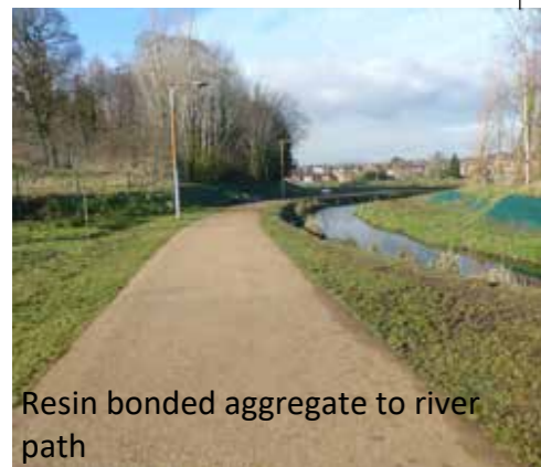
Resin bonded aggregate to river path