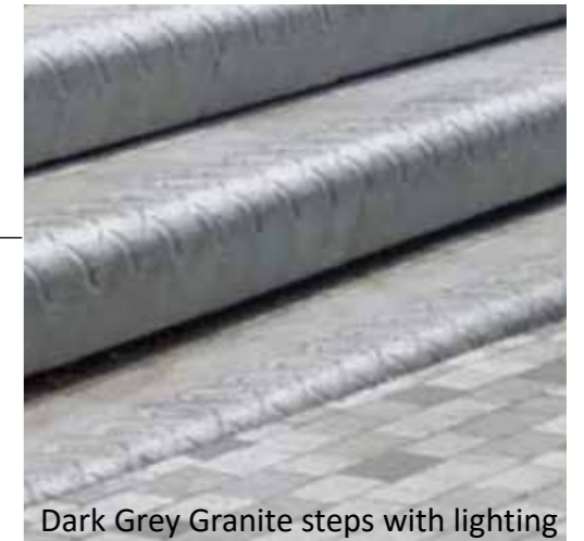
Dark Grey Granite steps with lighting