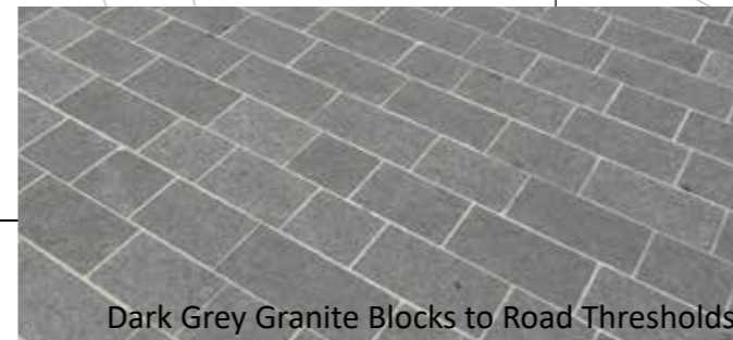
Dark Grey Granite Blocks to Road Thresholds