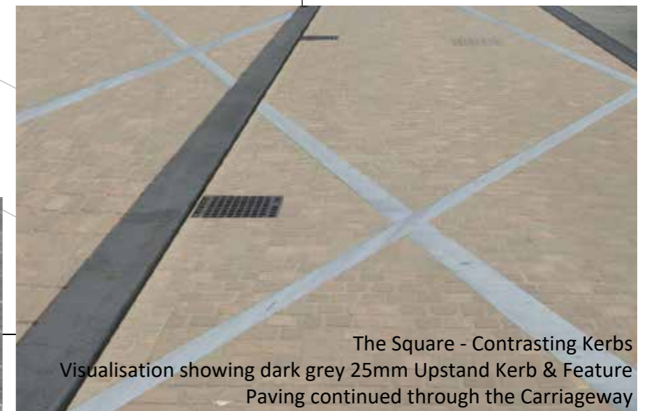
The Square - Contrasting Kerbs Visualisation showing dark grey 25mm Upstand Kerb & Feature Paving continued through the Carriageway