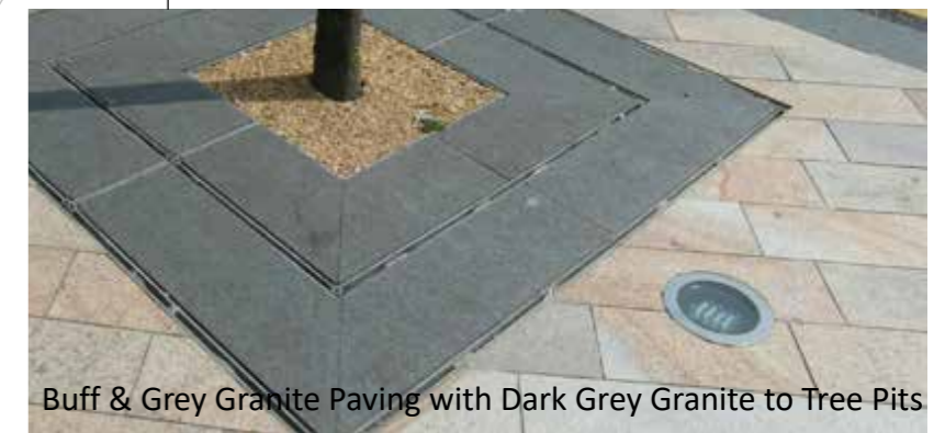
Buff & Grey Granite Paving with Dark Grey Granite to Tree Pits