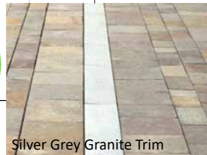
Silver Grey Granite Trim