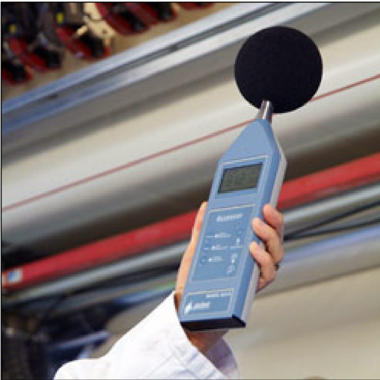
Figure 3: Noise Monitoring

Noise monitoring will be carried out in accordance with any Kildare County Council (KCC) planning consent and also in accordance with Safety, Health and Welfare at Work (Construction) Regulations 2013 , Safety, Health and Welfare at Work Act 2005 , BS 6187:2011 - Code of Practice for Full & Partial Demolition , BS 5228:2009 Code of Practice for Noise & Vibration Control on Construction & Open Sites , Environmental Protection Agency Act 1992 .