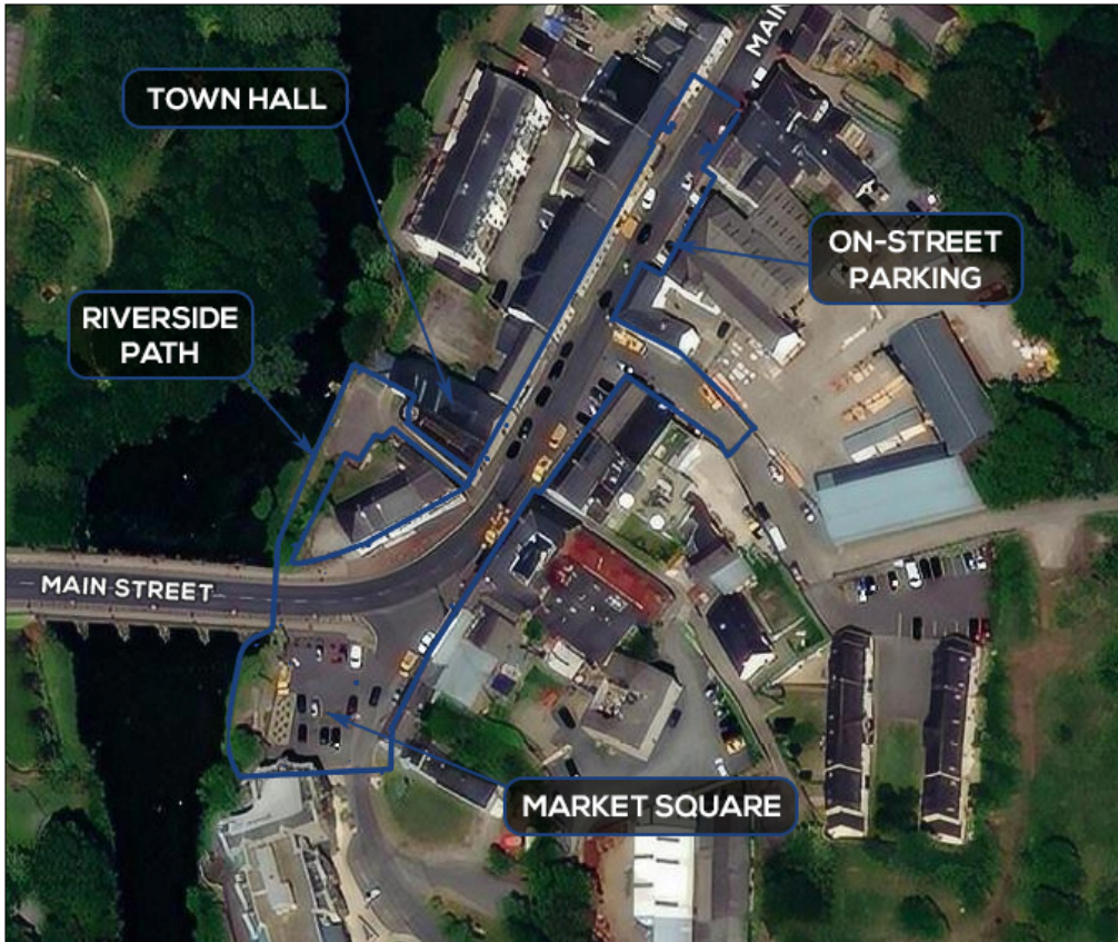
Figure 2: Site Environs

The proposed development will consist of both demolition and construction works. The demolition will consist of existing footpath paving layout of the area within the red line boundary. The proposed works will also include provision of site boundary protection to all frontages and all ancillary site works.